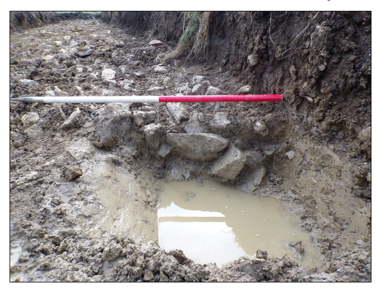
Figure 2. Section through field boundary [1004] facing south Scale 0.5m divisions