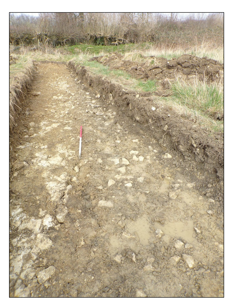
Figure 3. General view of field boundary [1004] looking north Scale 0.5m divisions.