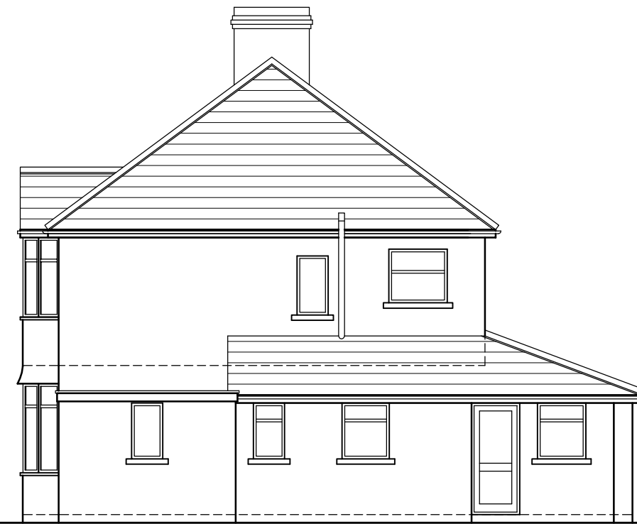
SIDE ELEVATION FACING 118