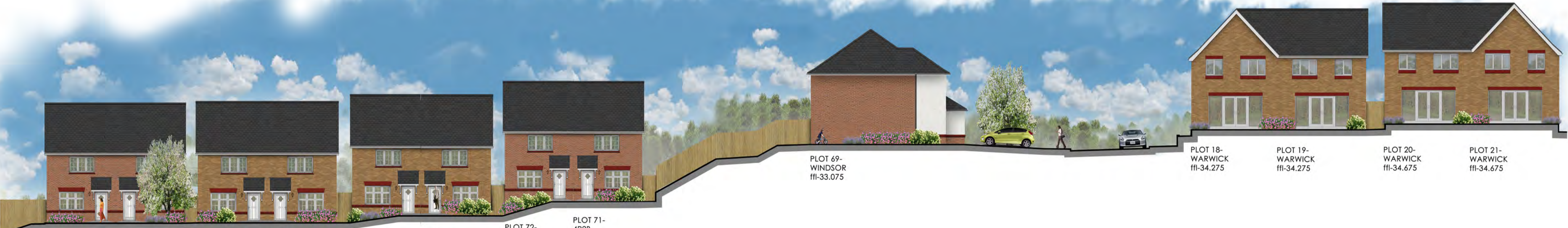
ELEVATION - CC Plots 18-21 & 69-78