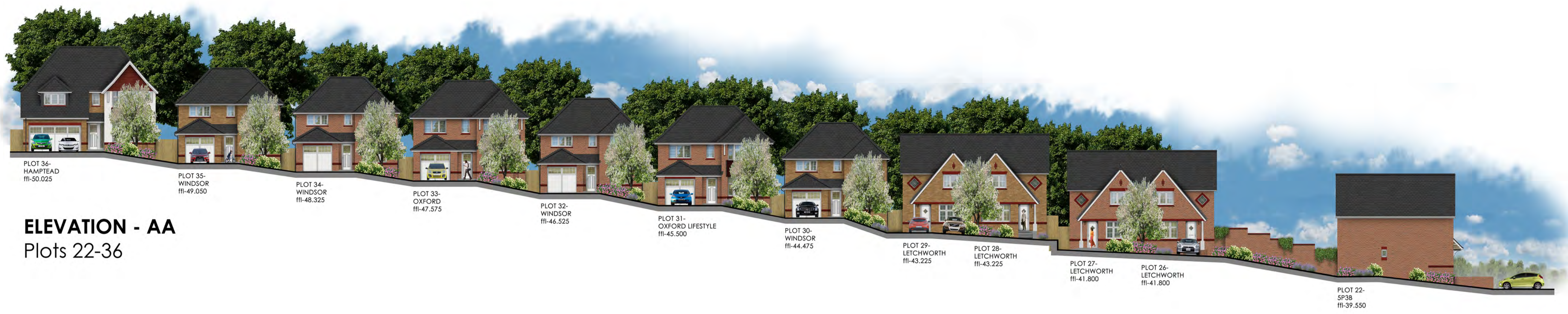
ELEVATION - AA Plots 22-36