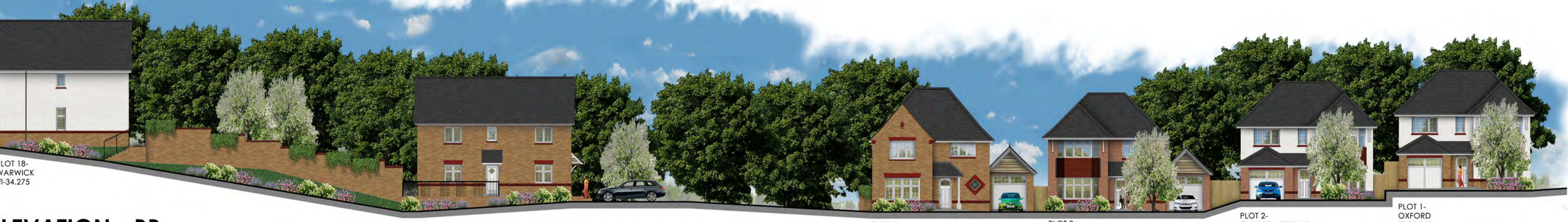
ELEVATION - BB Plots 1-18