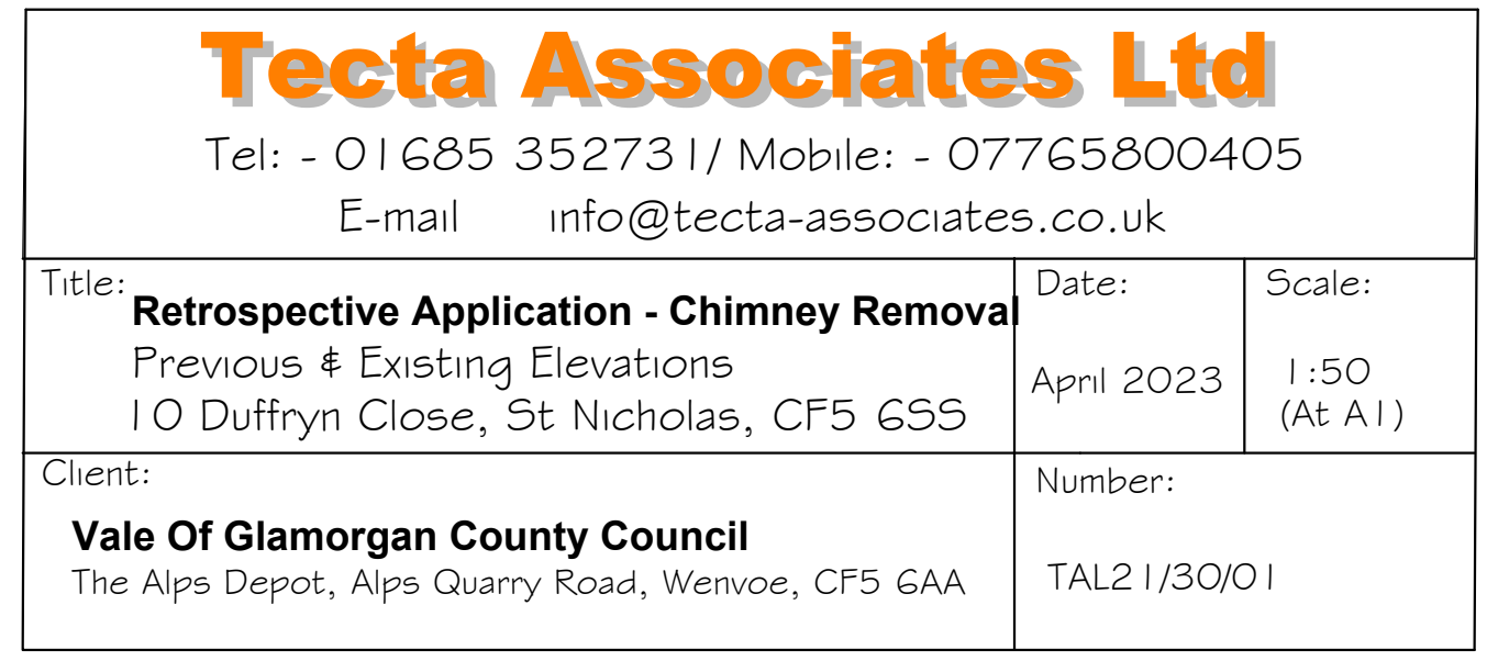
Previous Rear Elevation

Do not scale from this drawing, all dimensions must be checked on site.