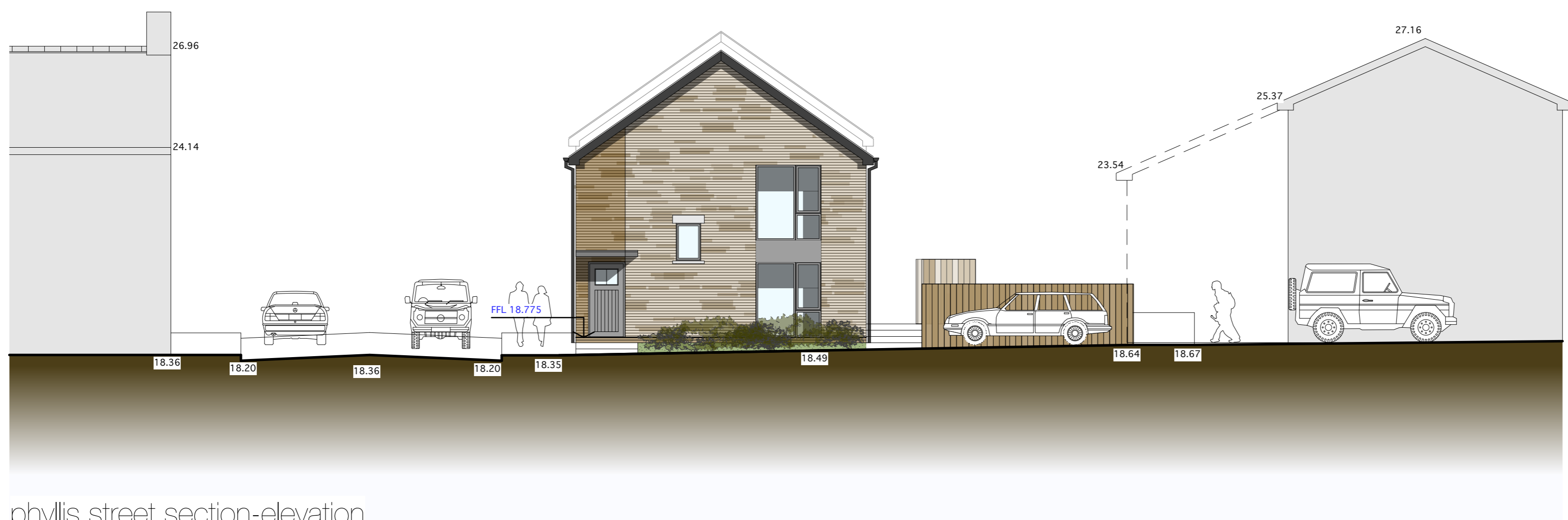
phyllis street section-elevation