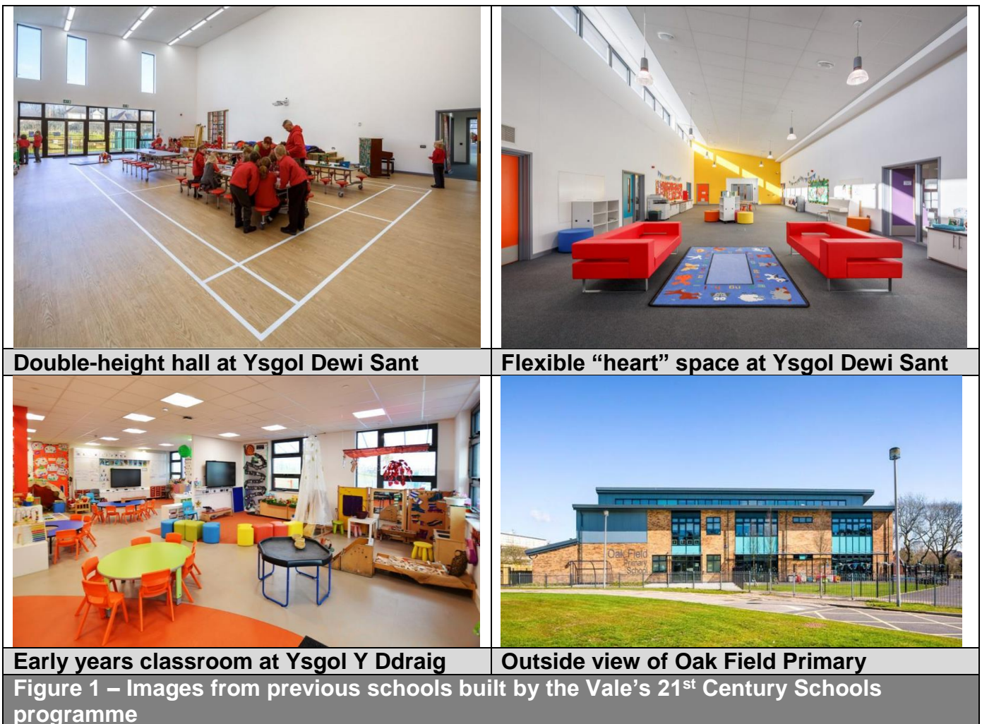
Figure 1 – Images from previous schools built by the Vale’s 21 st Century Schools programme