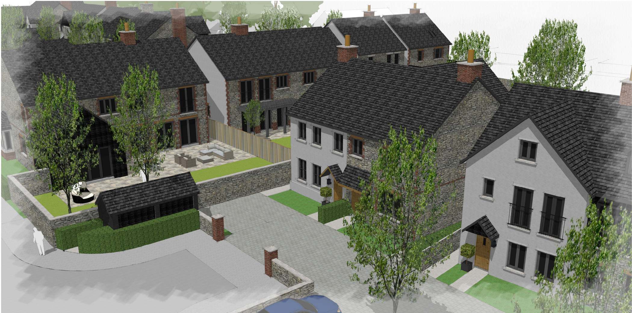
Semi-elevated view along the new access road looking into the rear gardens of Plots Seven and Eight ( Plots Nine - Fourteen on the right )