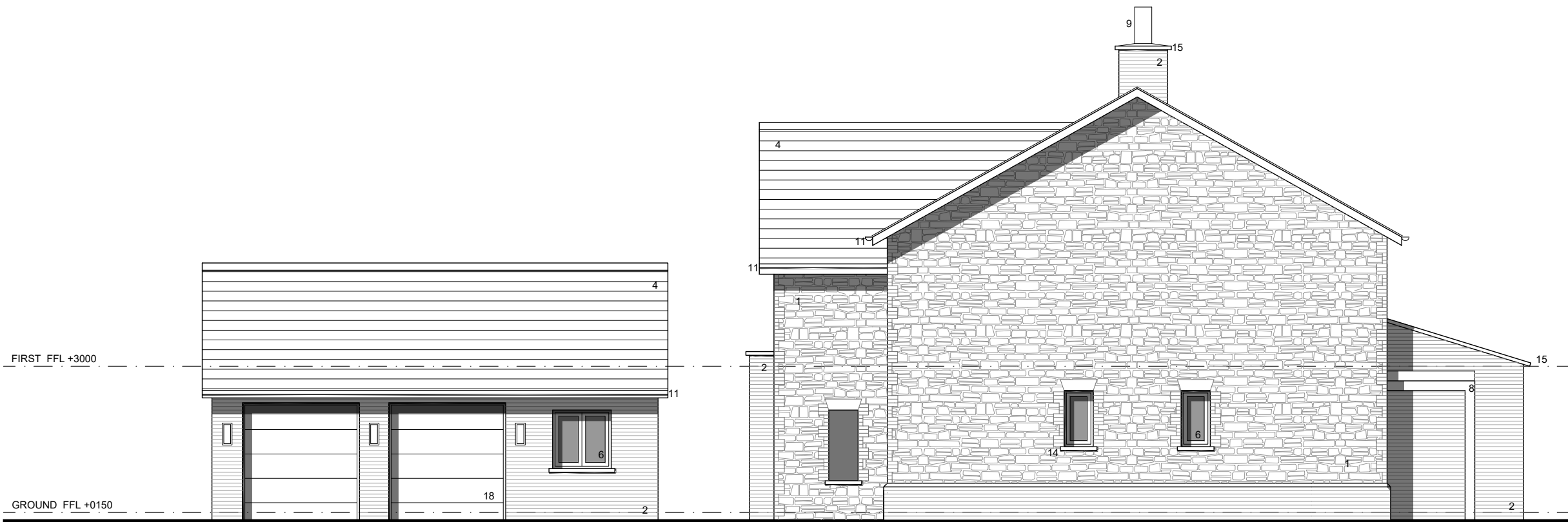
SIDE ELEVATION (WEST FACING)