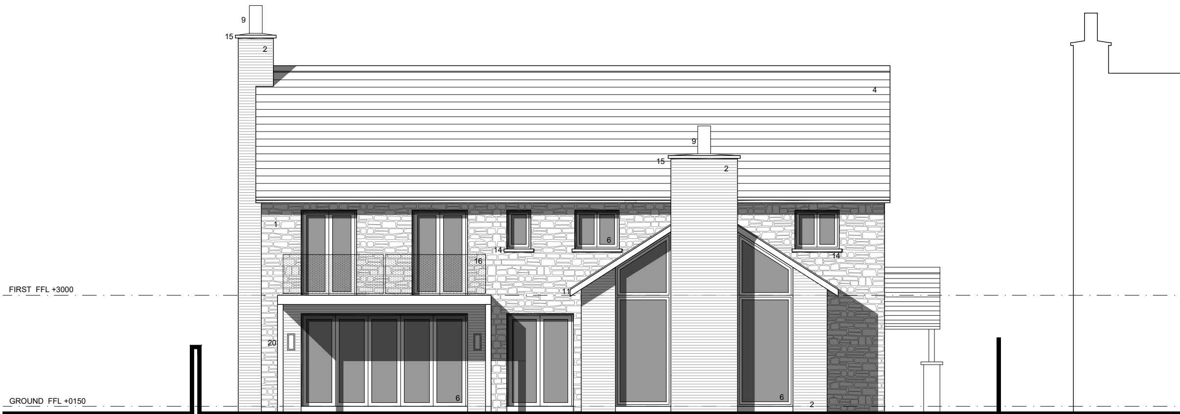
REAR ELEVATION (EAST FACING)