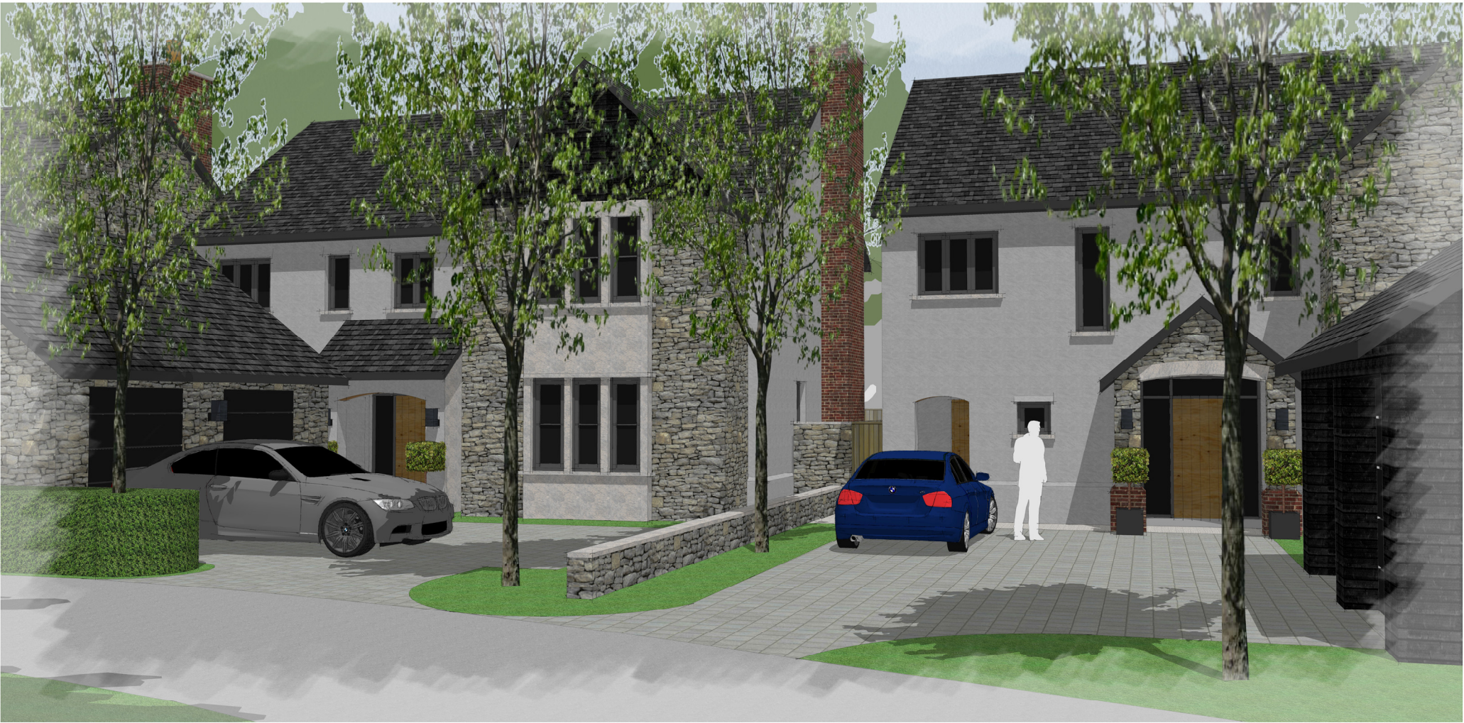
Front elevations of Plots Two and Three