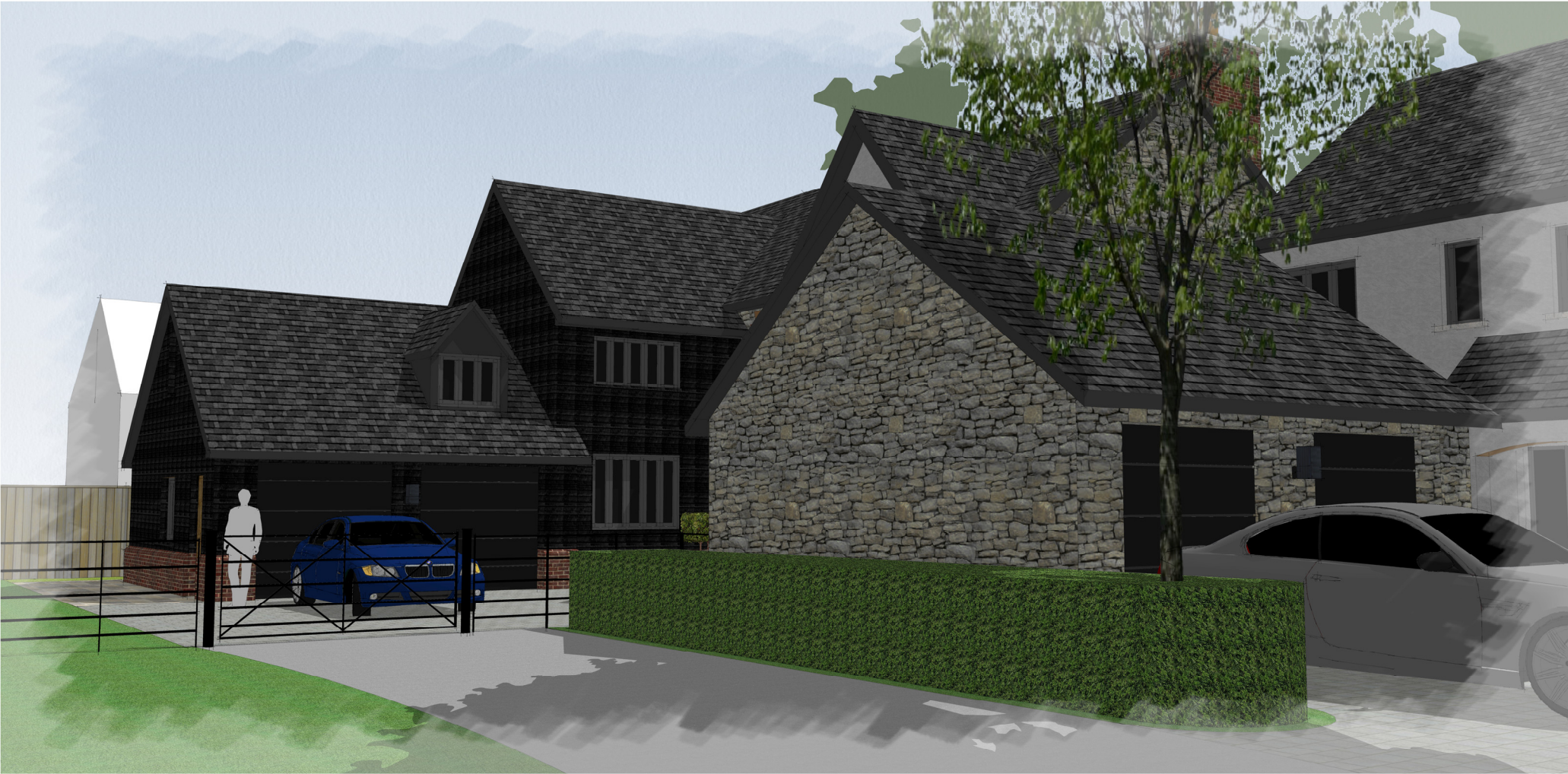
View from the private drive looking north-east at the front elevation of Plot One