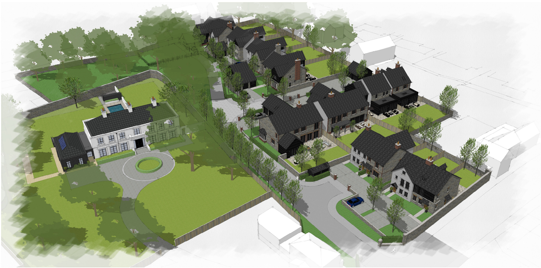
Elevated view of the site looking north-east (shown in context with consented adjacent Woodlands to the west)