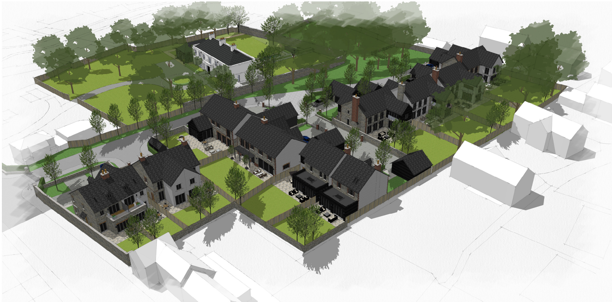
Elevated view of the site looking north-west from above the A48 (shown in context with consented adjacent Woodlands to the west)