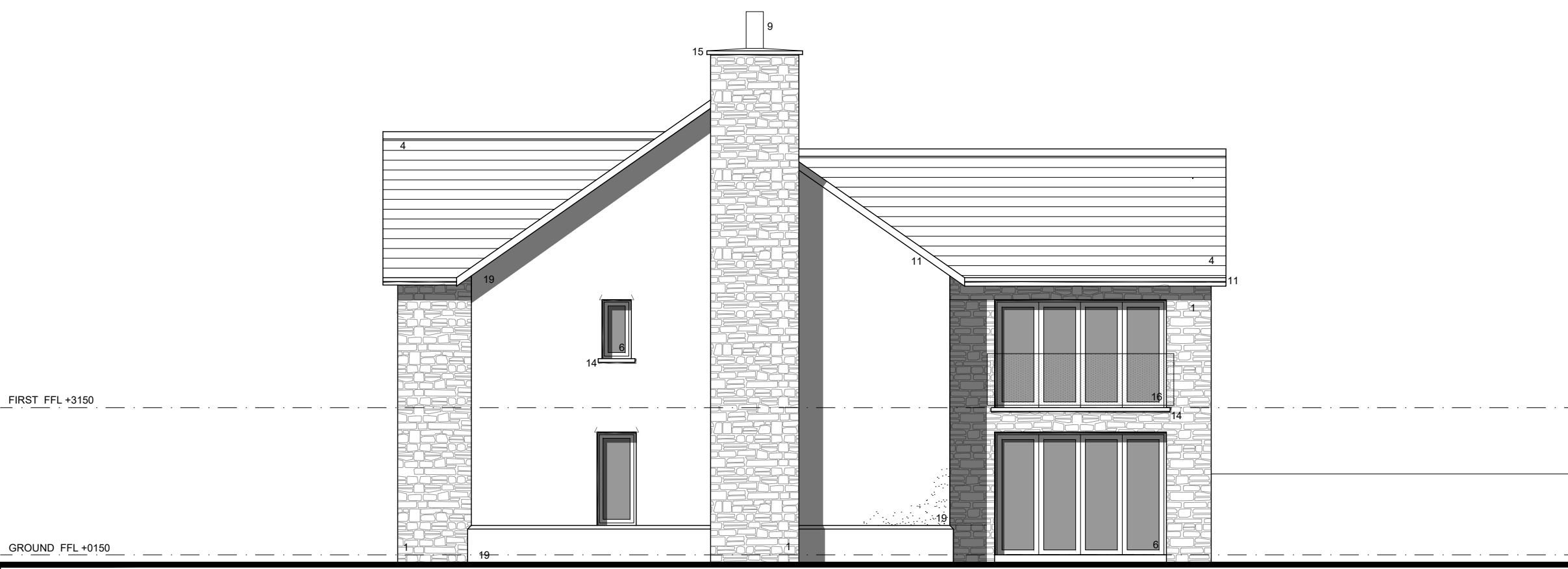
SIDE ELEVATION (SOUTH FACING)