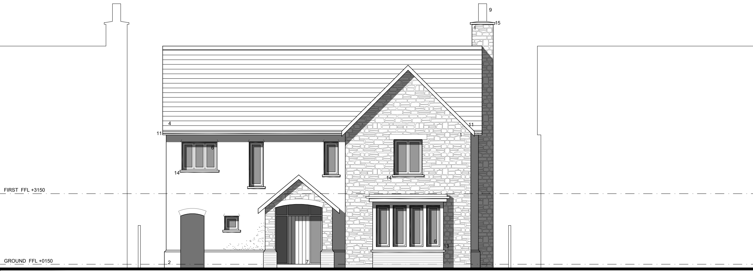
FRONT ELEVATION (WEST FACING)