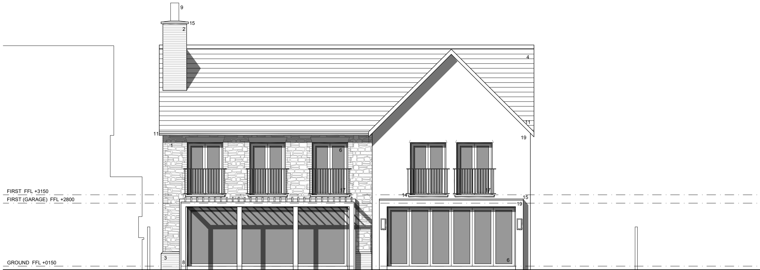
SIDE ELEVATION (EAST FACING)