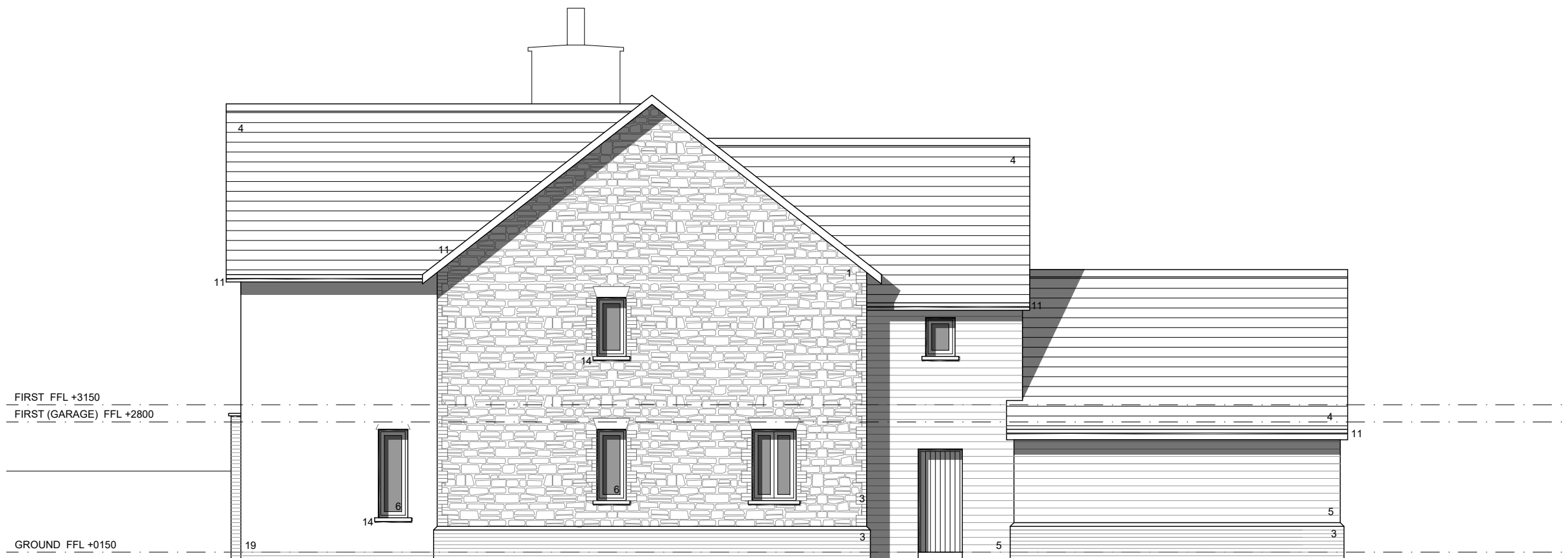
REAR ELEVATION (NORTH FACING)