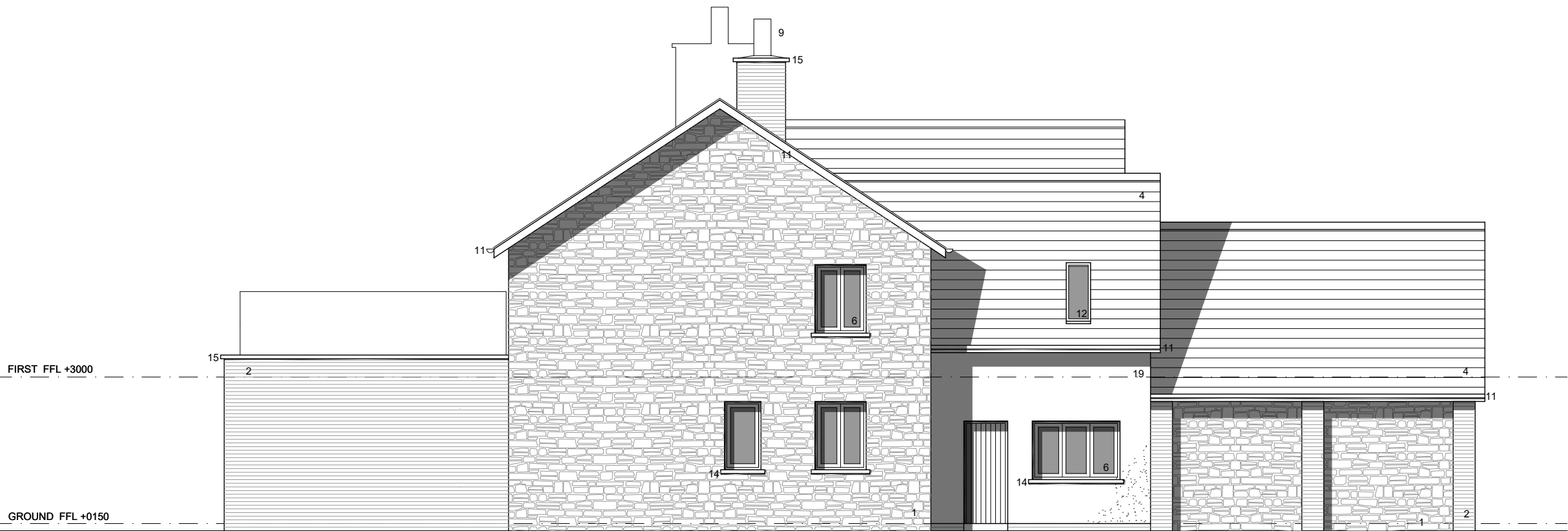
SIDE ELEVATION (NORTH FACING)