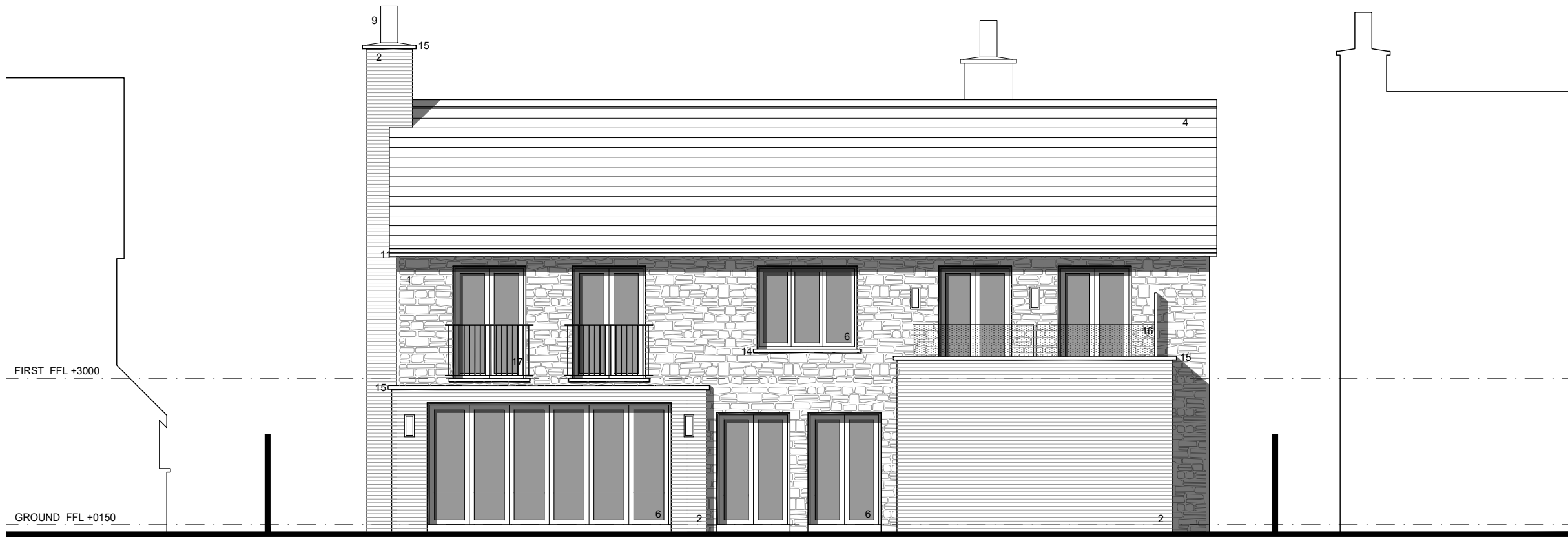
REAR ELEVATION (EAST FACING)