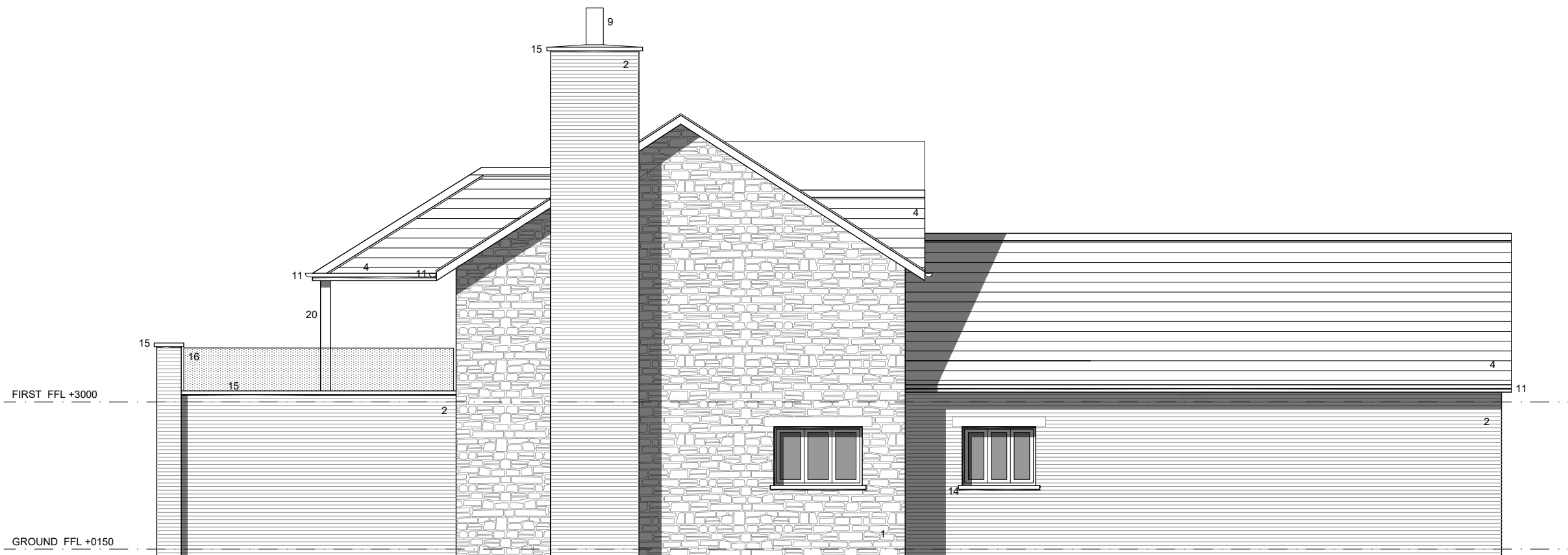
SIDE ELEVATION (NORTH FACING)