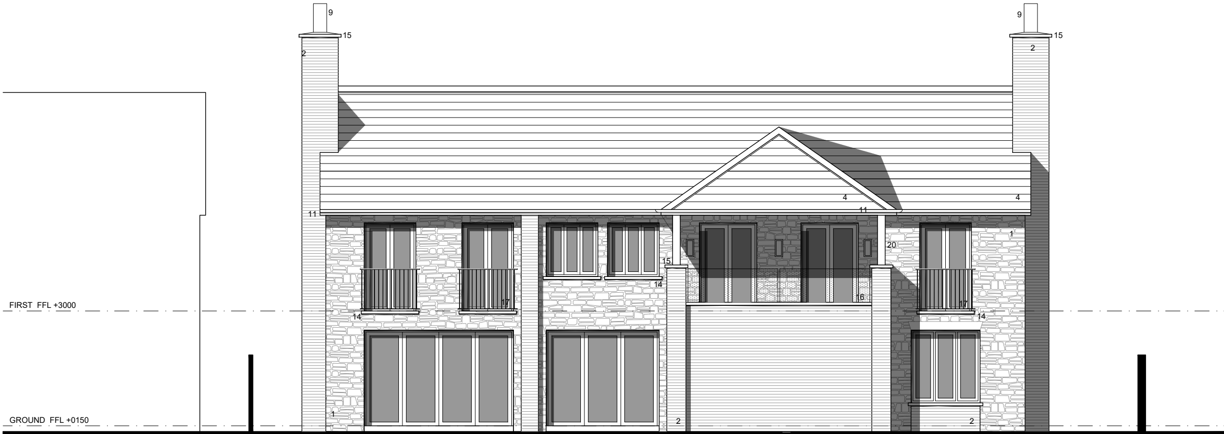
REAR ELEVATION (EAST FACING)