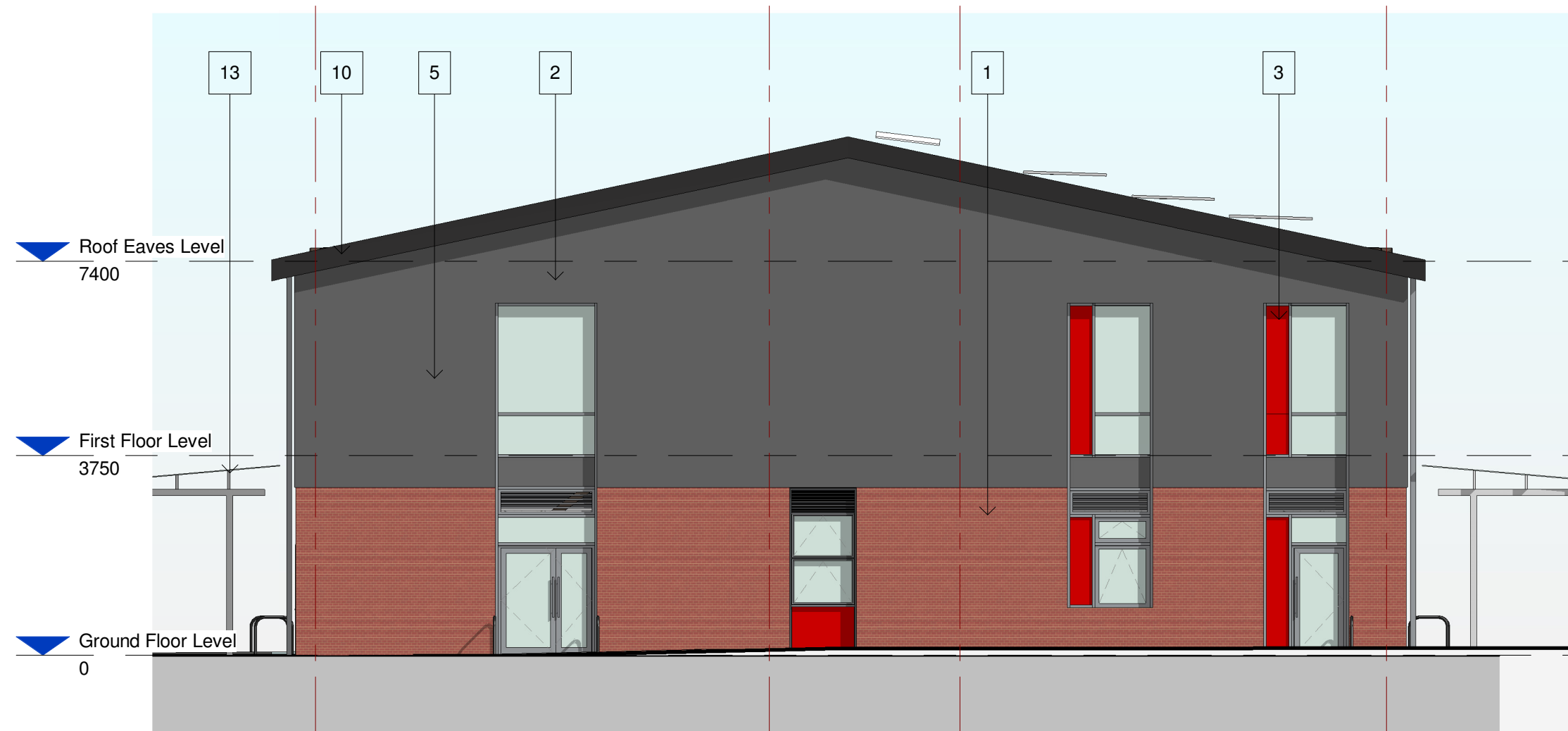
3 Proposed Elevation 03 1 : 100