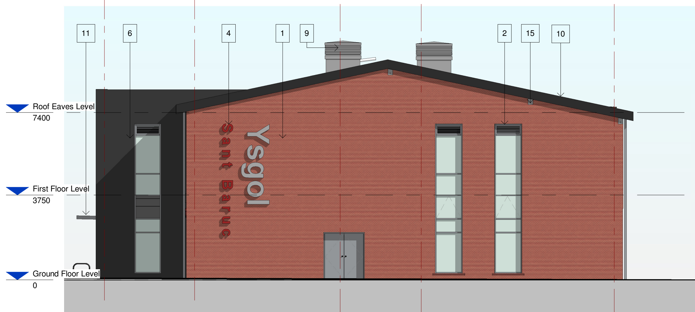
4 Proposed Elevation 04 1 : 100