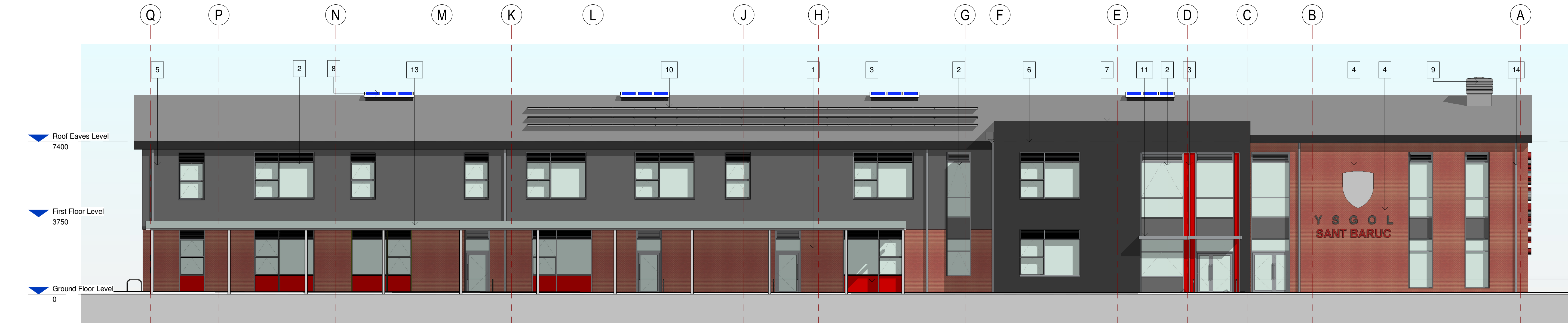
1 Proposed Elevation 01 1 : 100