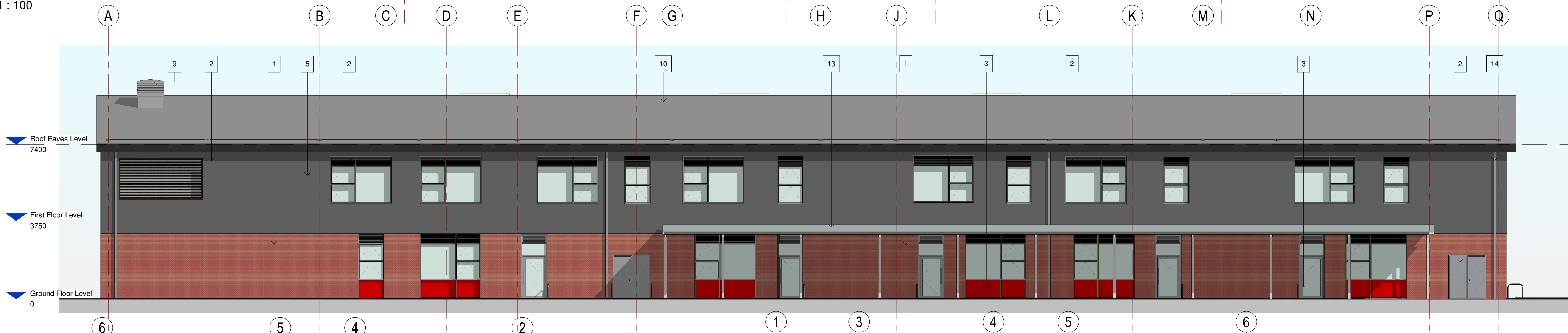
2 Proposed Elevation 02 1 : 100