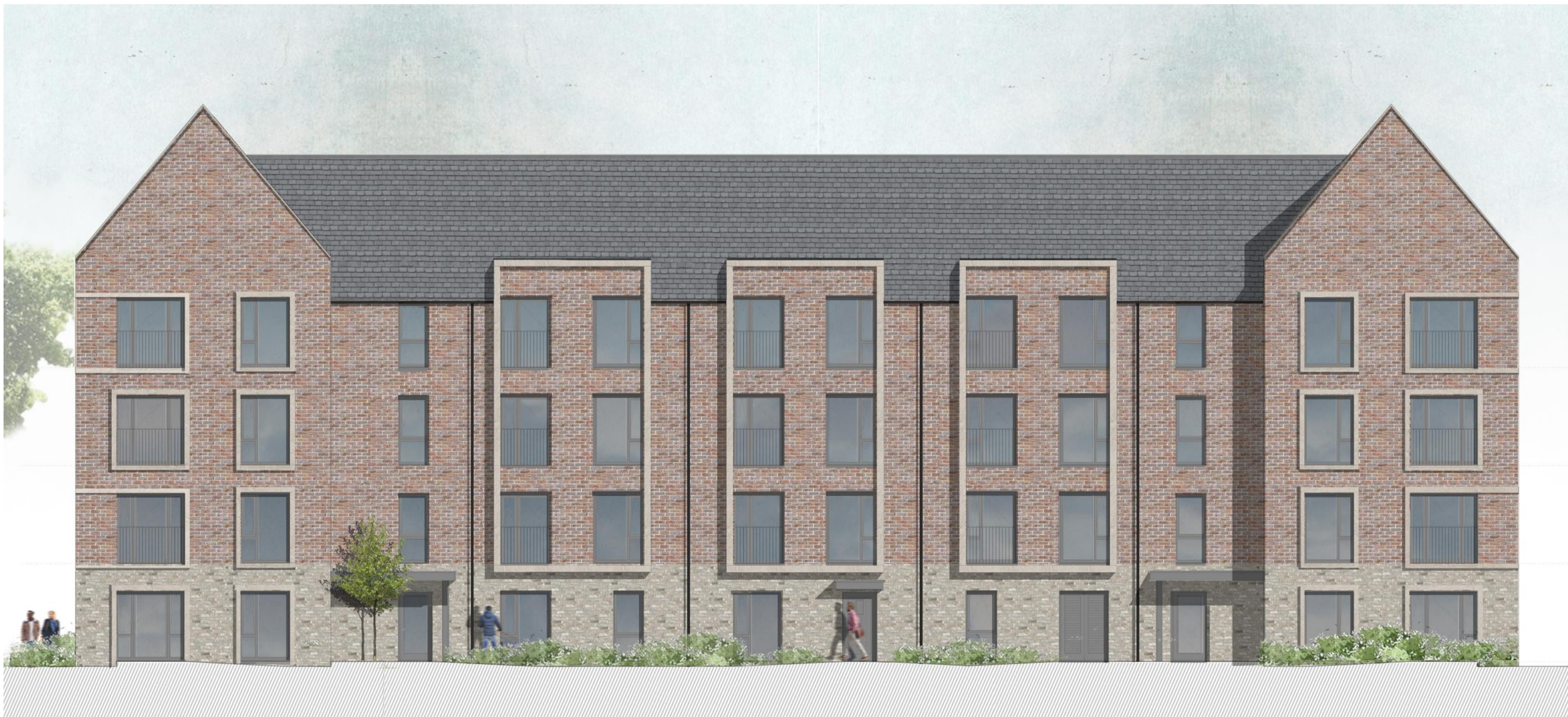
Rear Elevation (west)