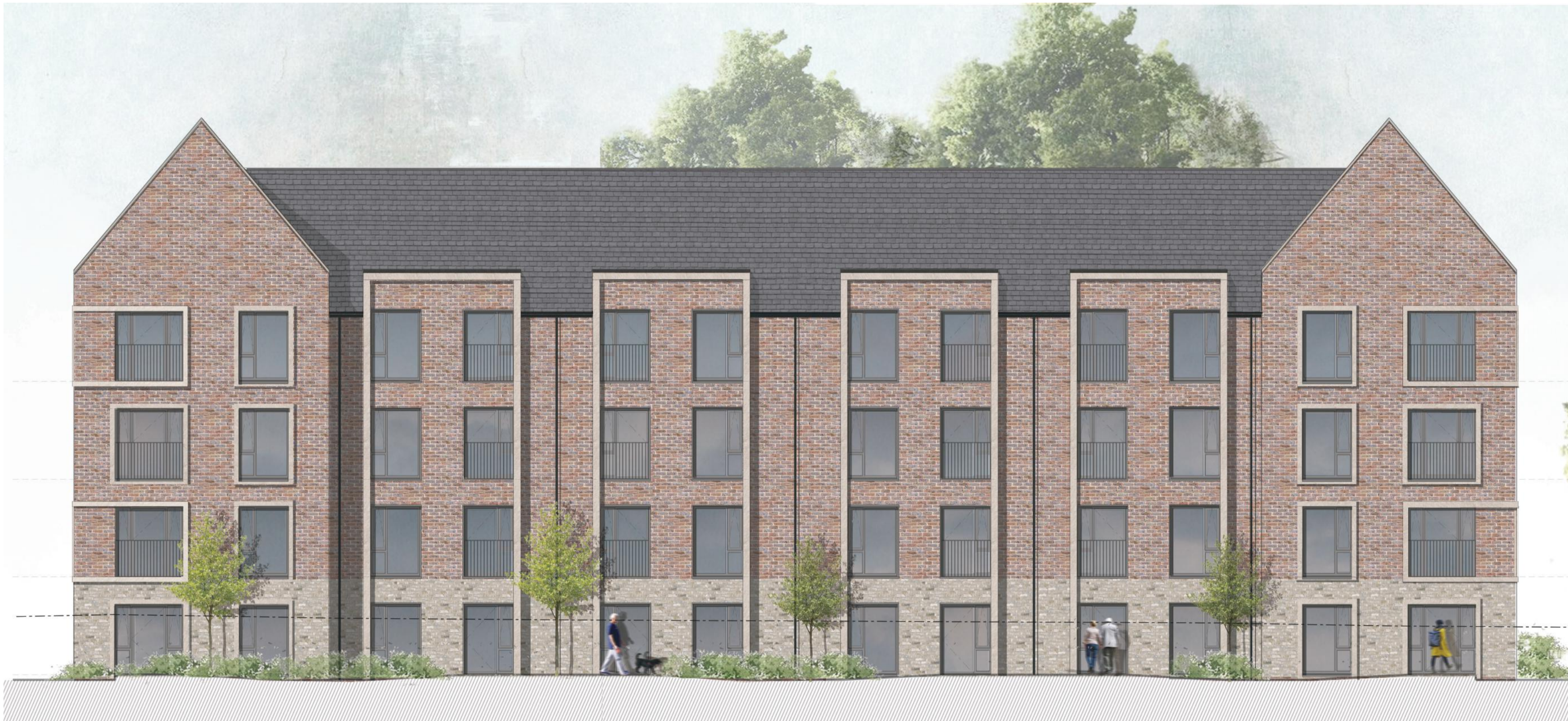
Front Elevation (Aberthin Road)