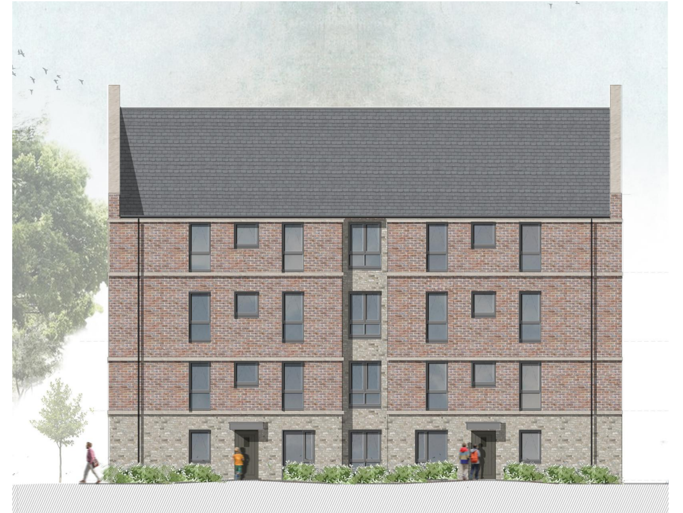
Side Elevation (north)