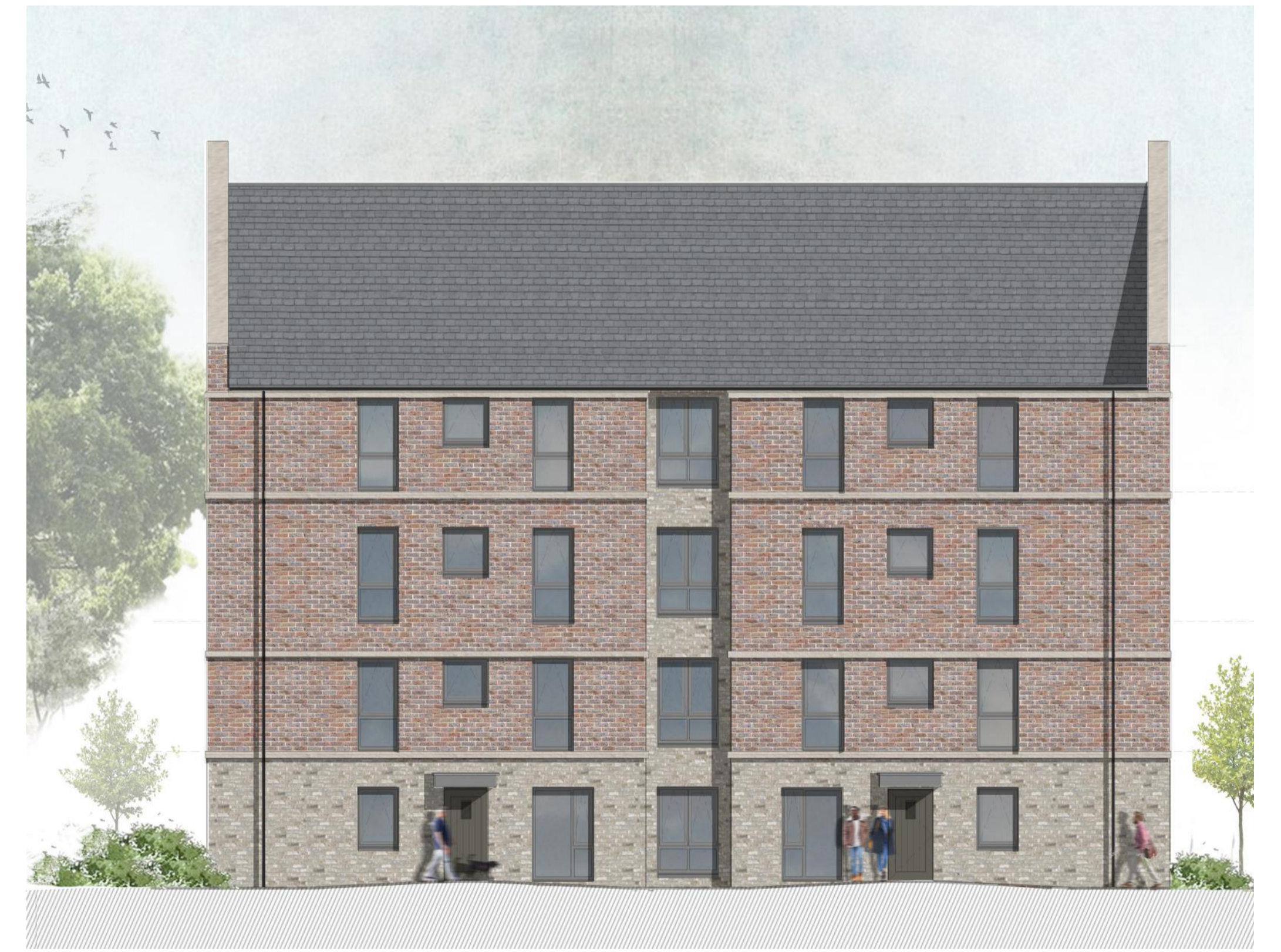
Side Elevation (south)