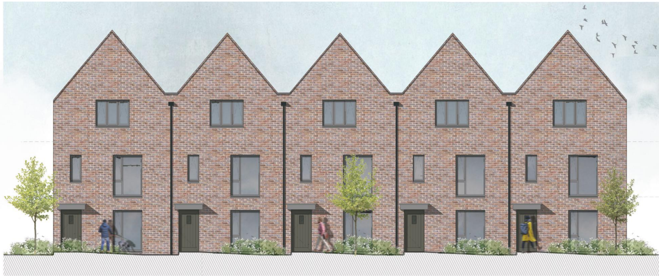
Front Elevation (Aberthin Road)