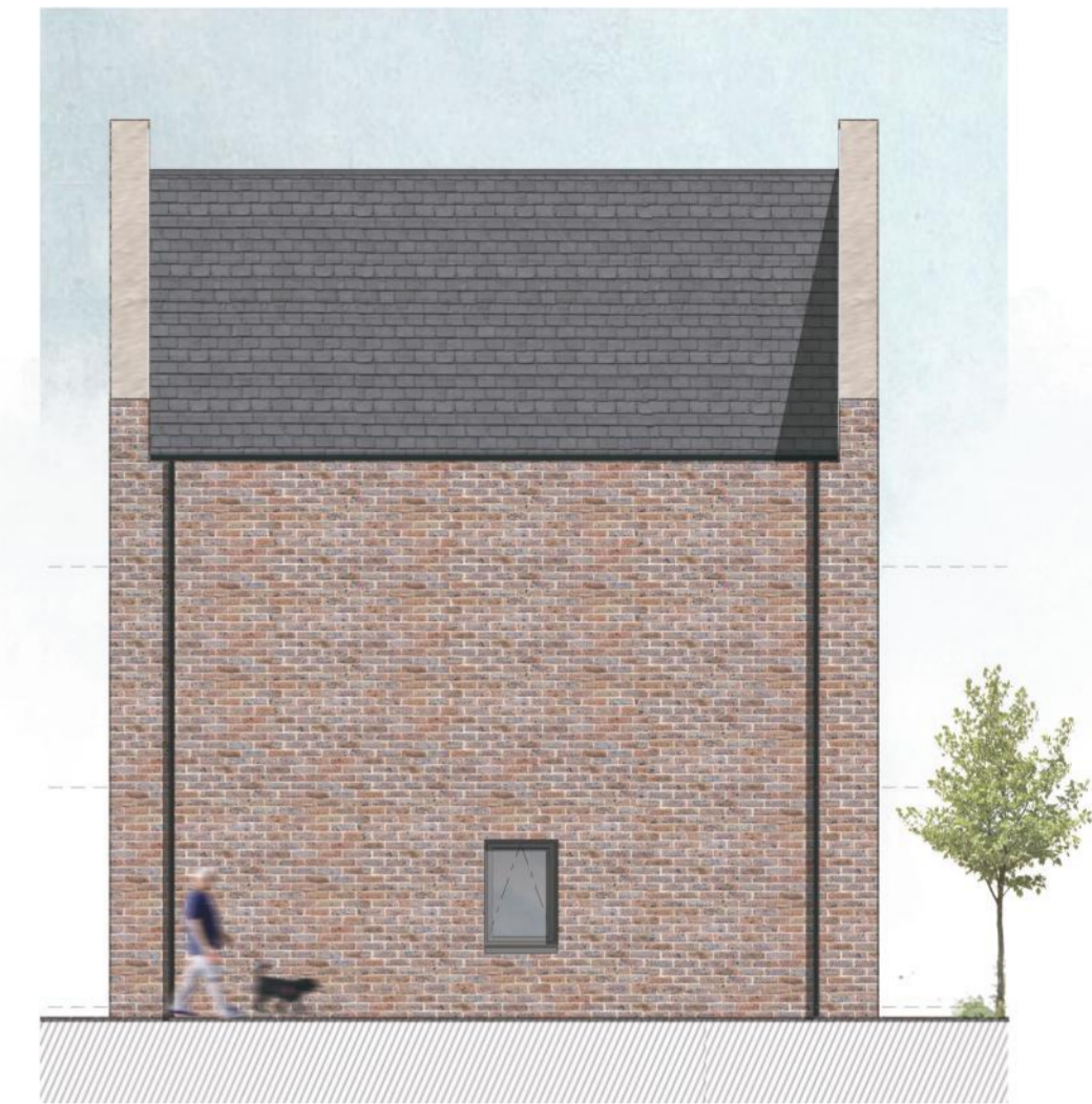
Side Elevation (south)