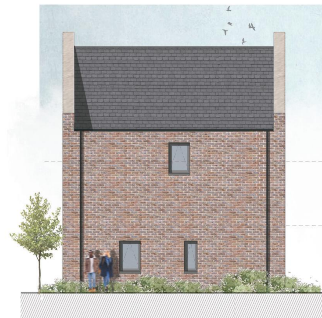
Side Elevation (north)