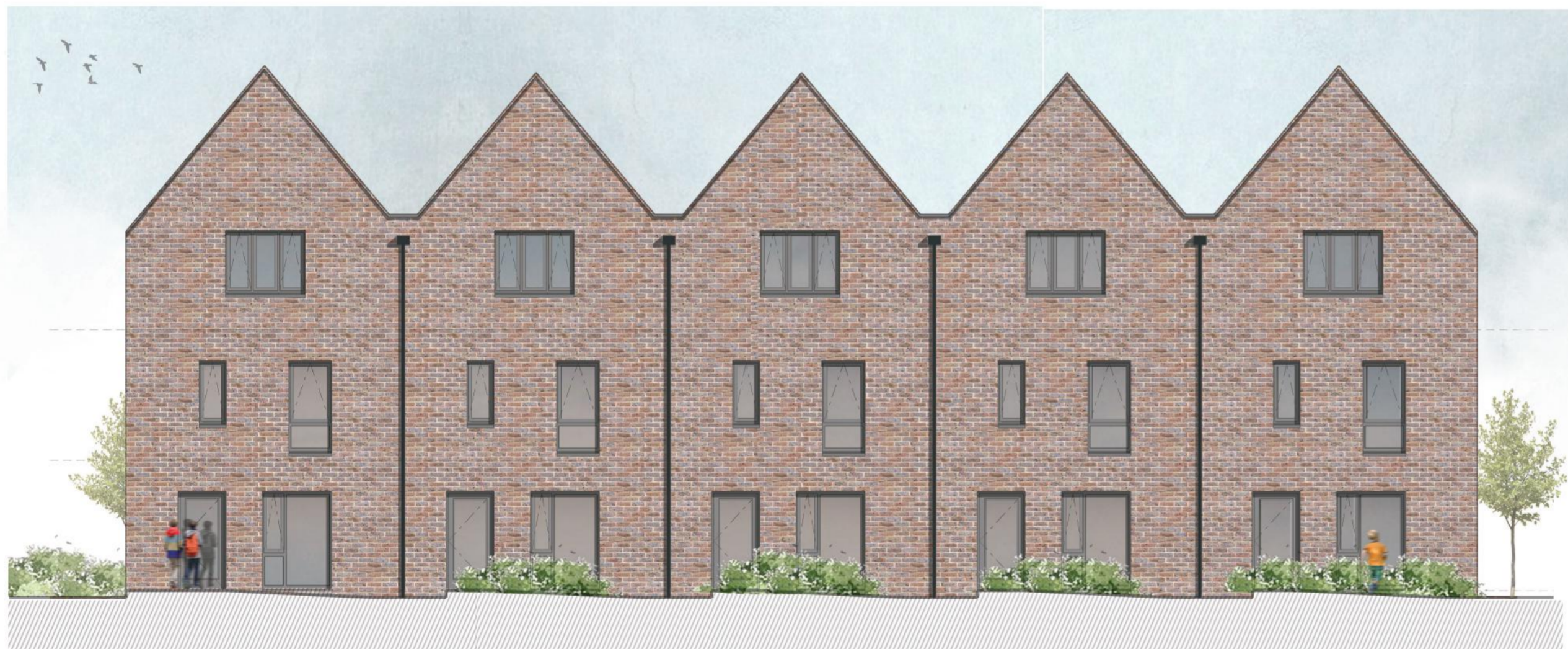
Rear Elevation (west)