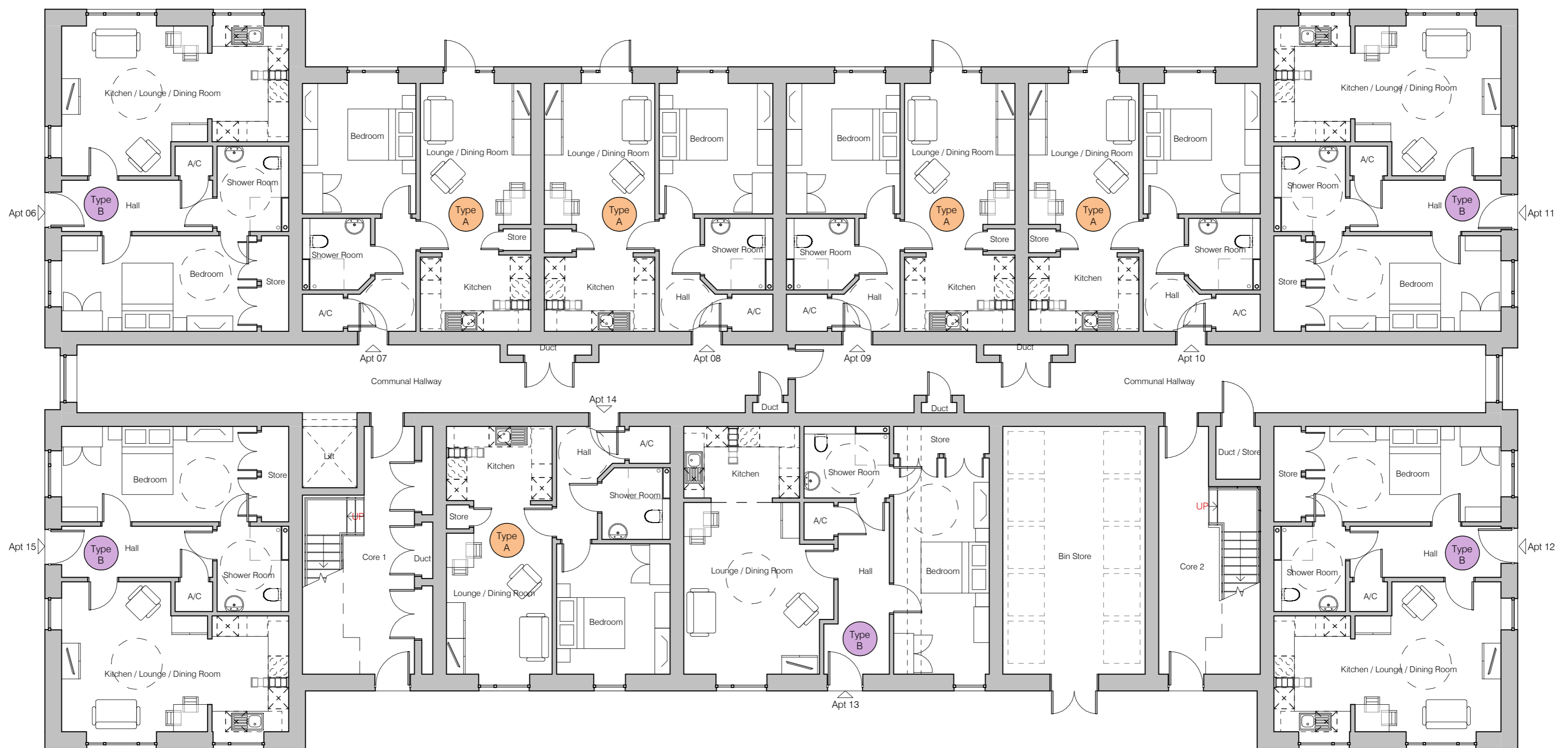
Ground Floor Plan 1 : 100