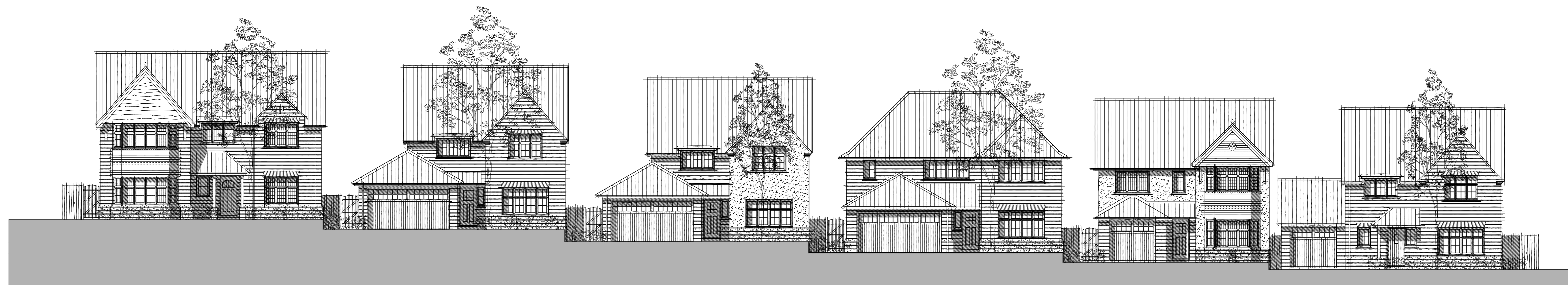
D - D PLOTS 91 - 96