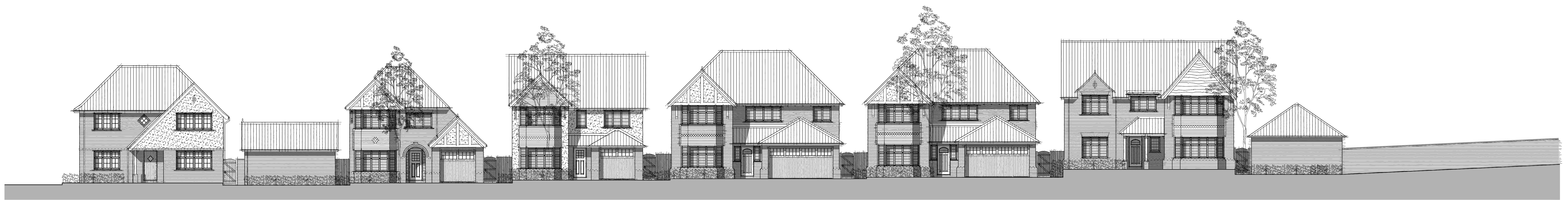
C - C PLOTS 134 & 83 - 87