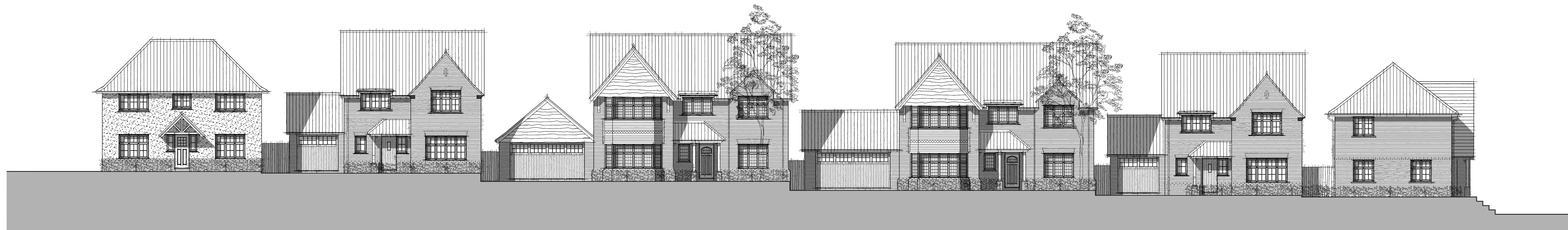
B - B PLOTS 76 - 80