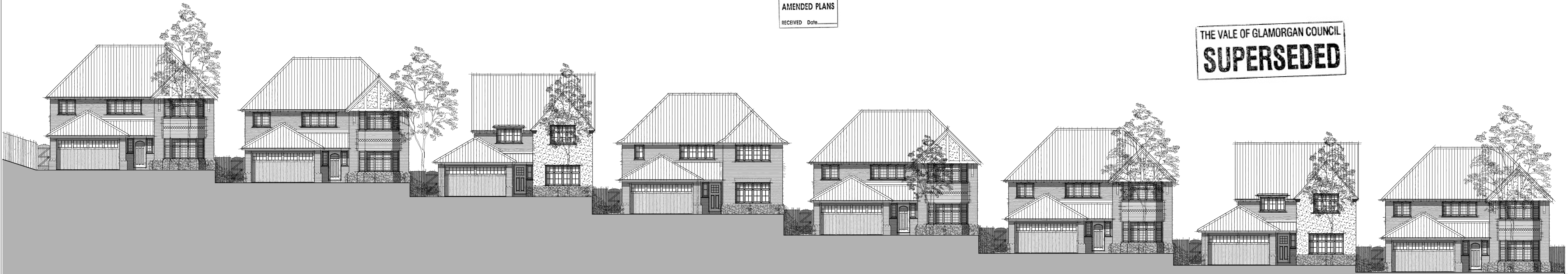
A - A PLOTS 68 - 75

THE VALE OF GLAMORGAN COUNCIL SUPERSEDED