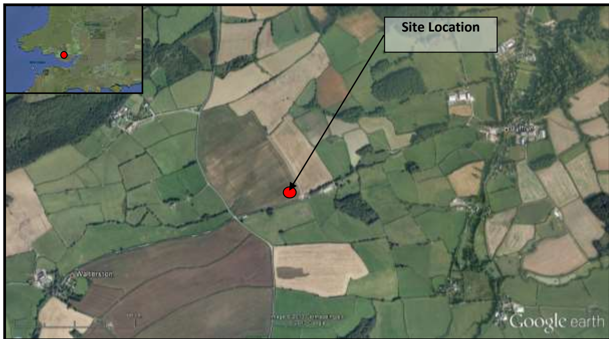
Figure 1: Location of site