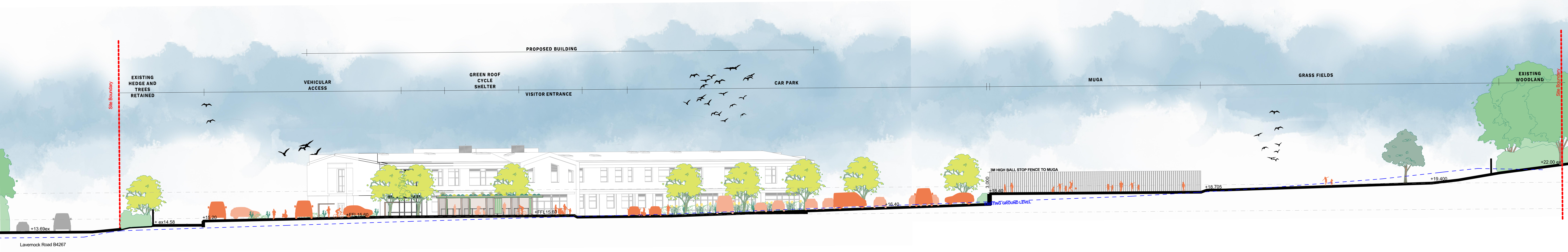
Site Section 1