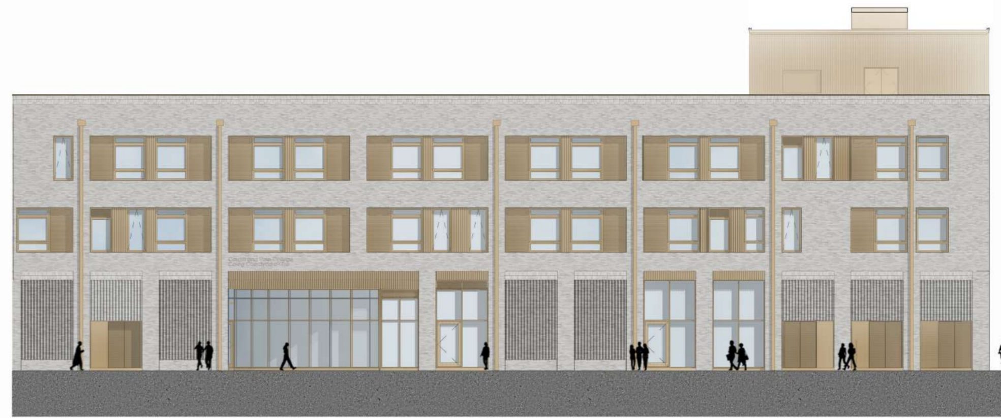
4 North West Elevation_Rendered 02201 1 : 200