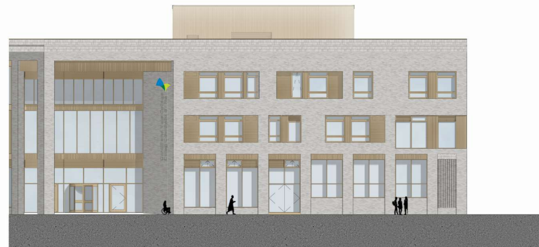
1 East Elevation_Rendered 02201 1 : 200