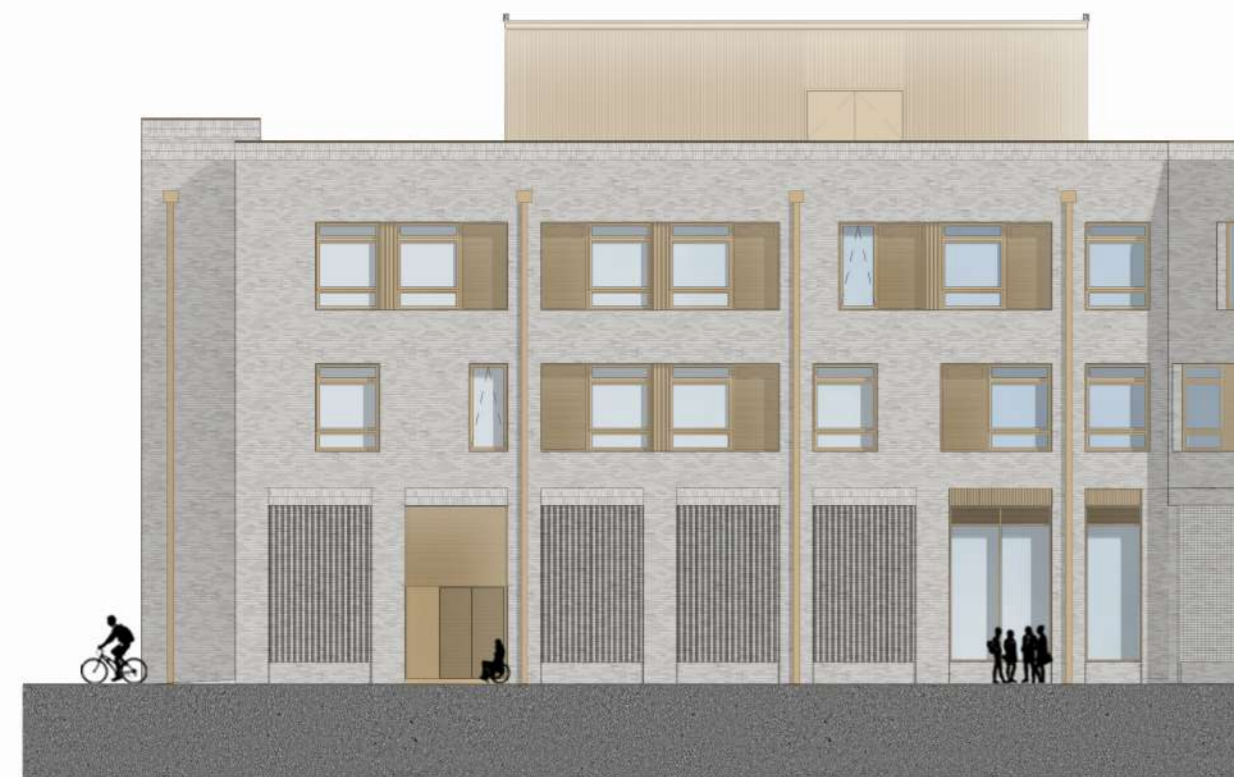
3 West Elevation_Rendered 02201 1 : 200