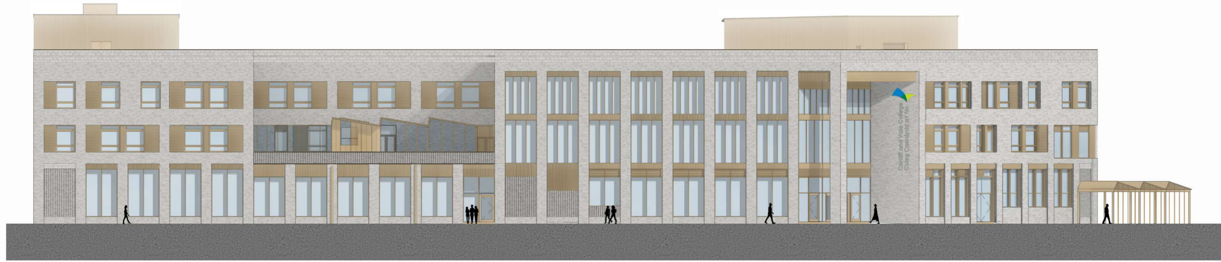
2 South East Elevation_Rendered 02201 1 : 200

FOR ELECTRONIC DATA ISSUE Electronic Data / drawings are issued as "read only" and should not be interrogated for measurement. All dimensions and levels should read, only from those values stated in text on the drawing.