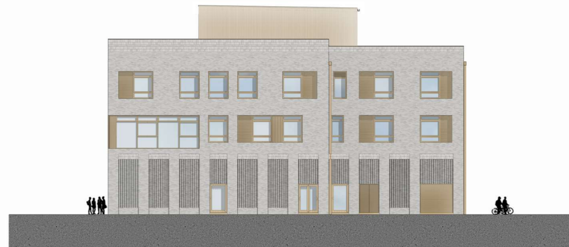
6 North Elevation_Rendered 02201 1 : 200