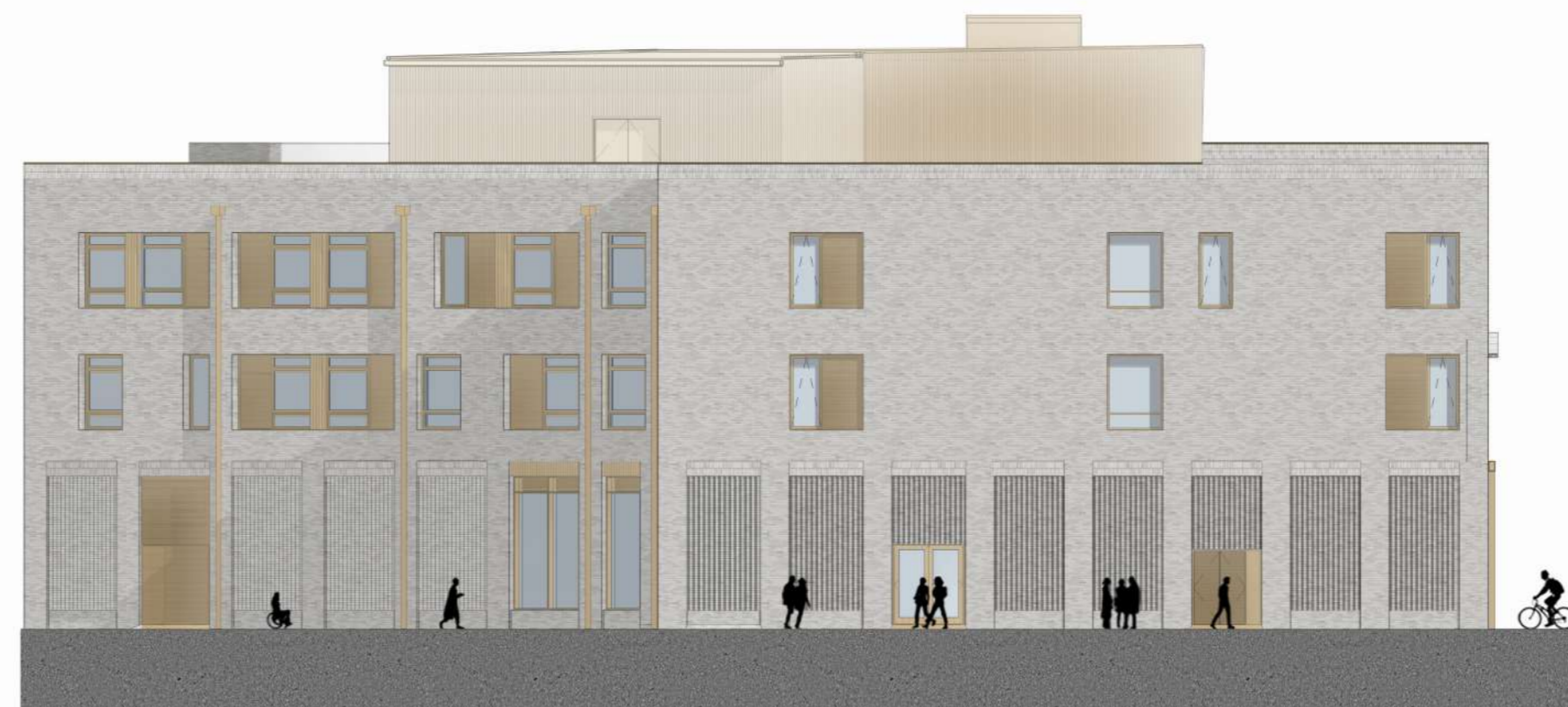
5 South West Elevation_Rendered 02201 1 : 200