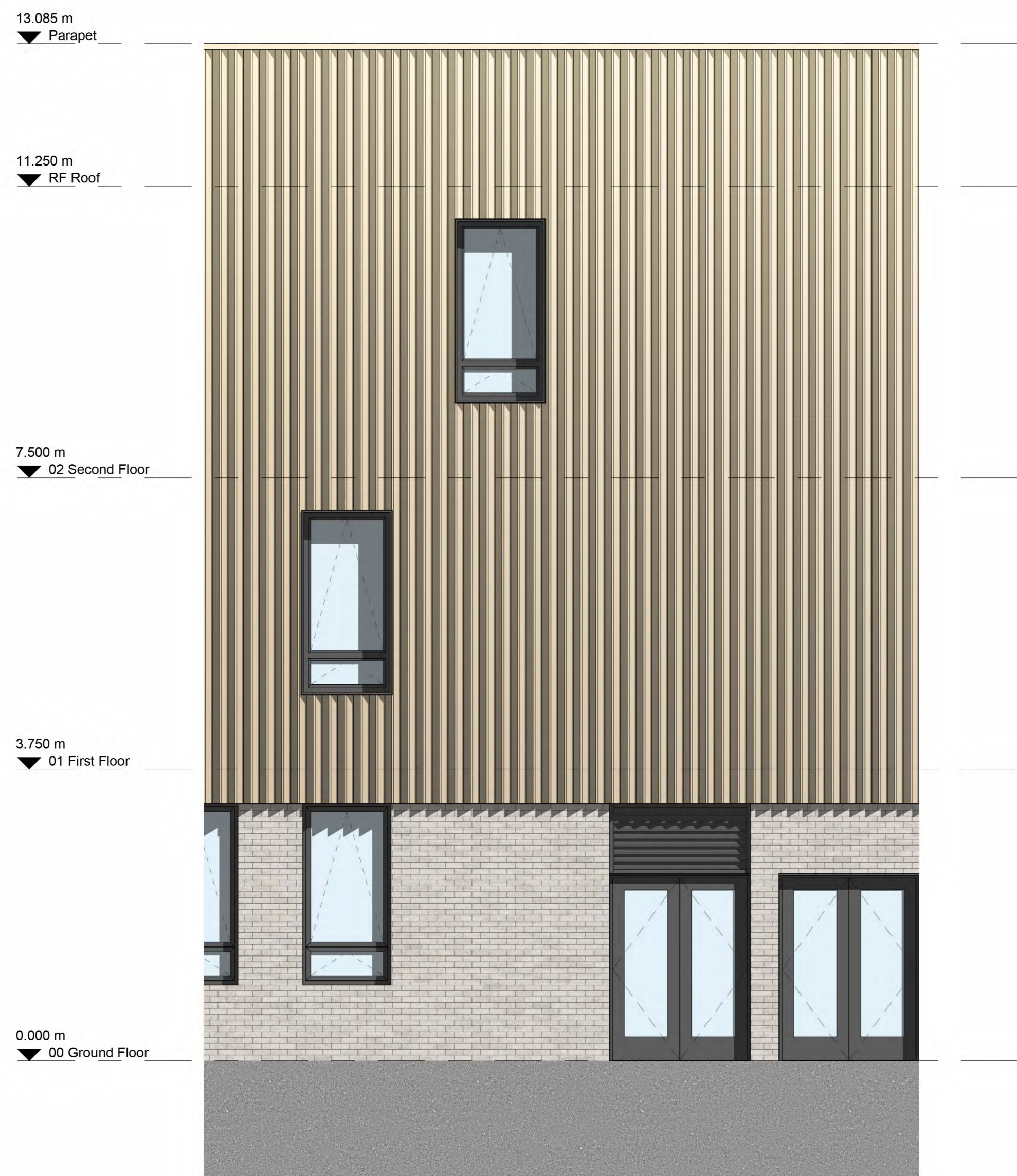
Teaching Block Strip Section - SE Courtyard

FOR ELECTRONIC DATA ISSUE Electronic Data / drawings are issued as "read only" and should not be interrogated for measurement. All dimensions and levels should read, only from those values stated in text on the drawing.