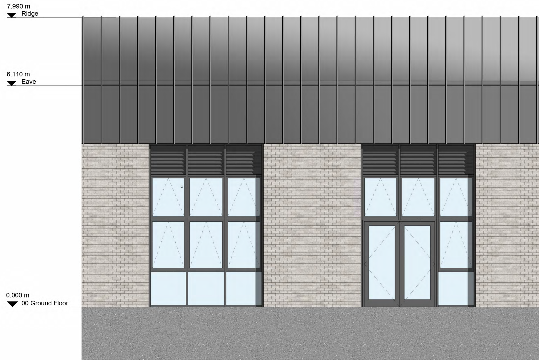
Workshops Bay Study

FOR ELECTRONIC DATA ISSUE Electronic Data / drawings are issued as "read only" and should not be interrogated for measurement. All dimensions and levels should read, only from those values stated in text on the drawing.