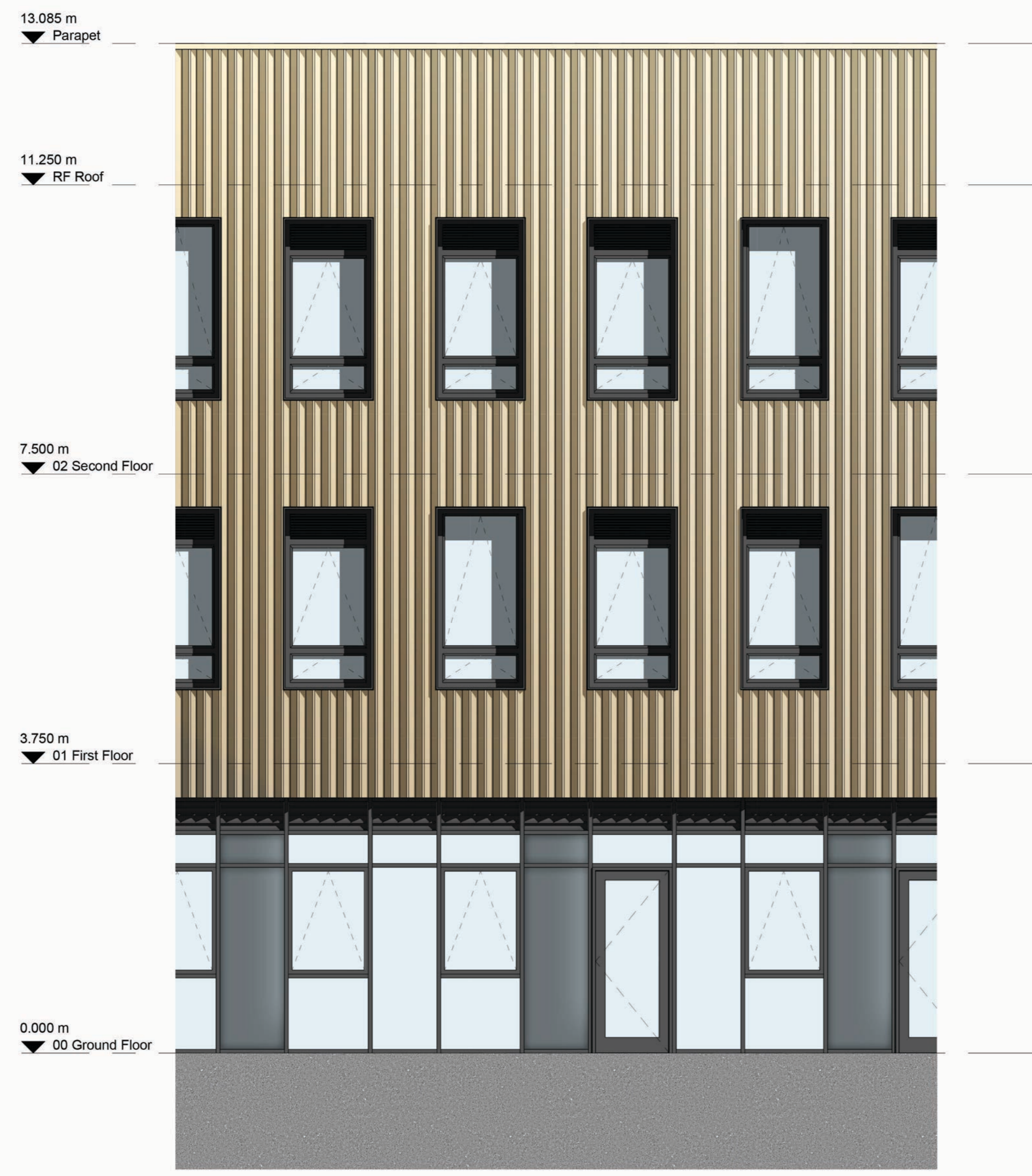
Teaching Block Bay Study

FOR ELECTRONIC DATA ISSUE Electronic Data / drawings are issued as "read only" and should not be interrogated for measurement. All dimensions and levels should read, only from those values stated in text on the drawing.