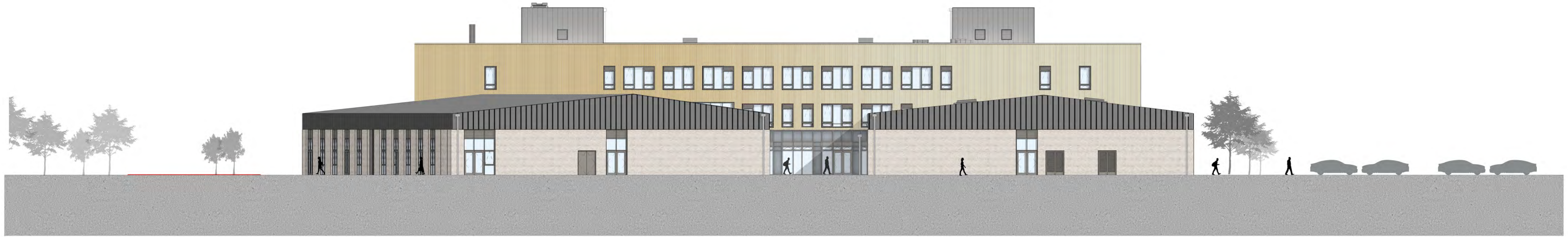
1 North East Elevation 02205 1 : 200