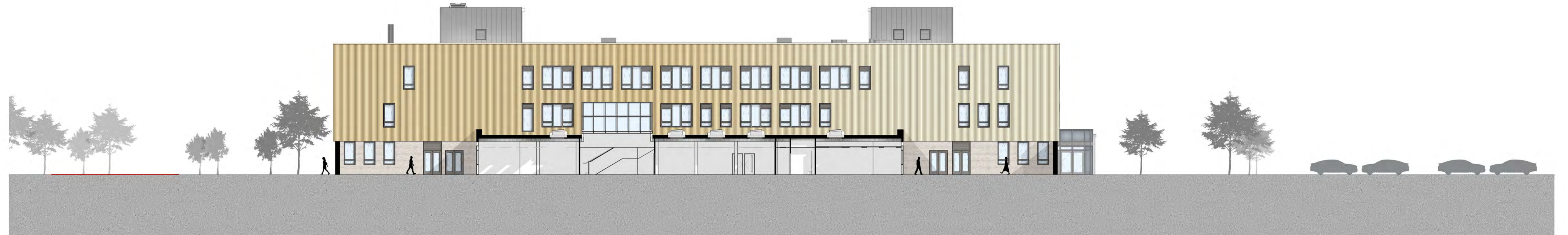
2 North East Elevation 02205 1 : 200