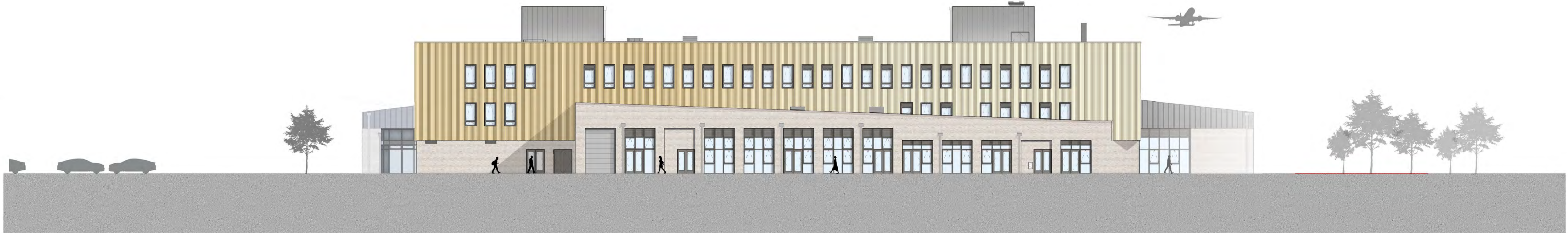
3 South West Elevation 02205 1 : 200

© COPYRIGHT The copyright in this drawing is vested in Sheppard Robson and no license or assignment of any kind has been, or is, granted to any third party whether by provision of copies or originals or otherwise unless agreed in writing.