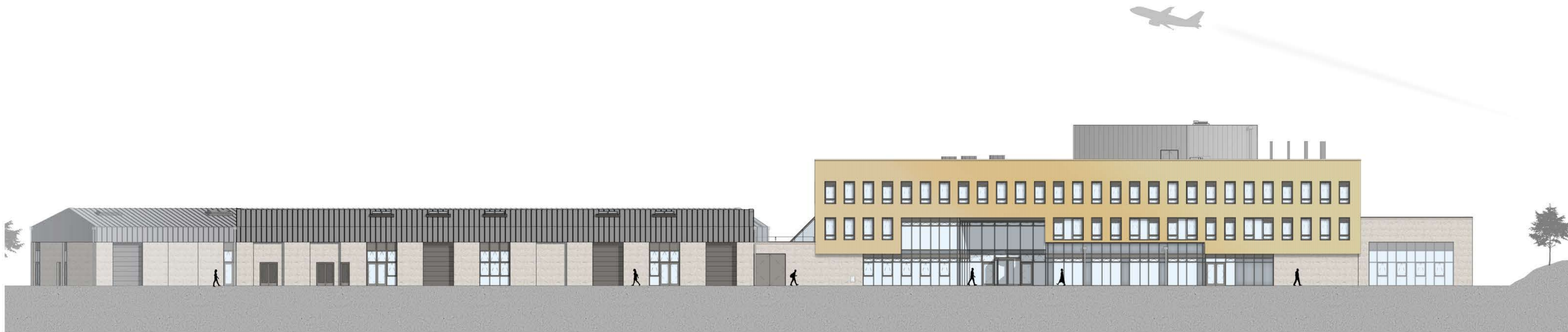
1 North West Elevation 1 : 200