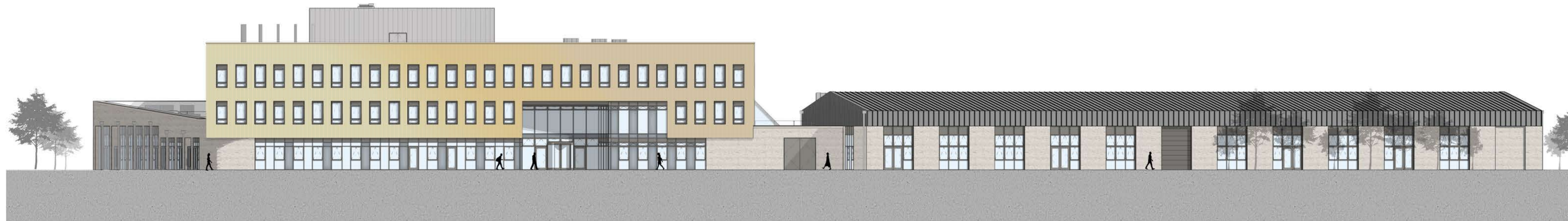
2 South East Elevation 1 : 200

© COPYRIGHT The copyright in this drawing is vested in Sheppard Robson and no license or assignment of any kind has been, or is, granted to any third party whether by provision of copies or originals or otherwise unless agreed in writing.