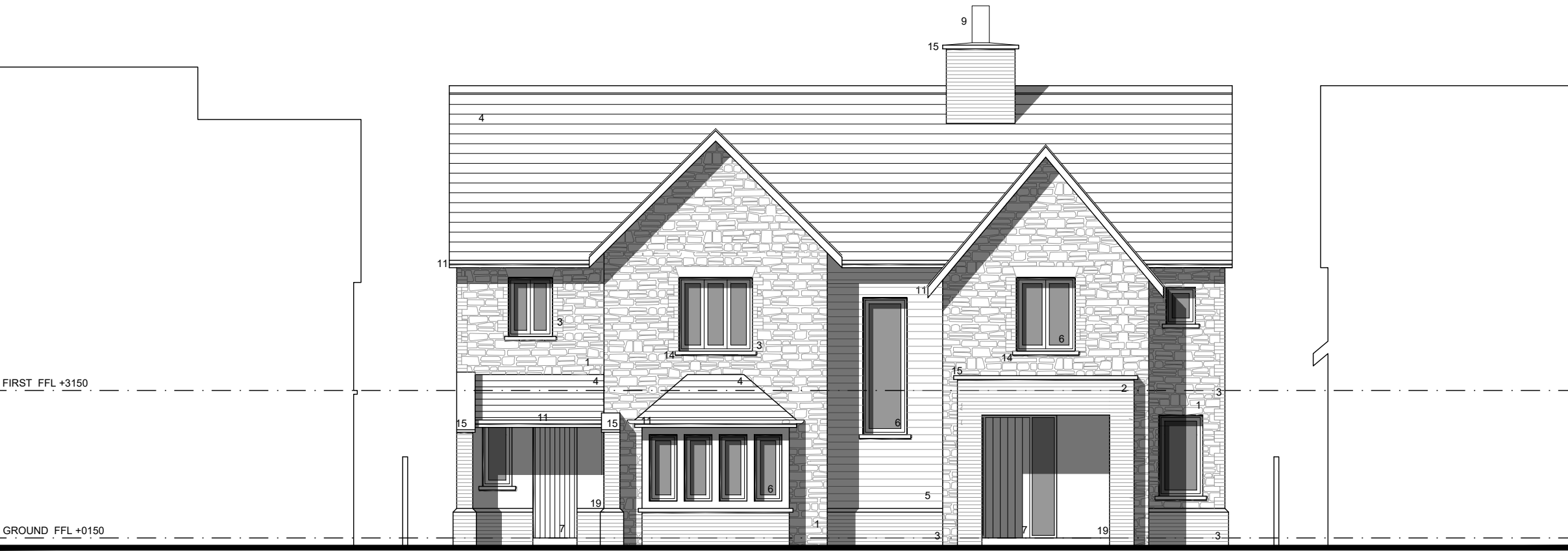
FRONT ELEVATION (NORTH FACING)