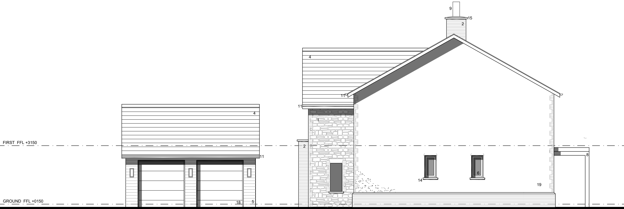
SIDE ELEVATION (WEST FACING)