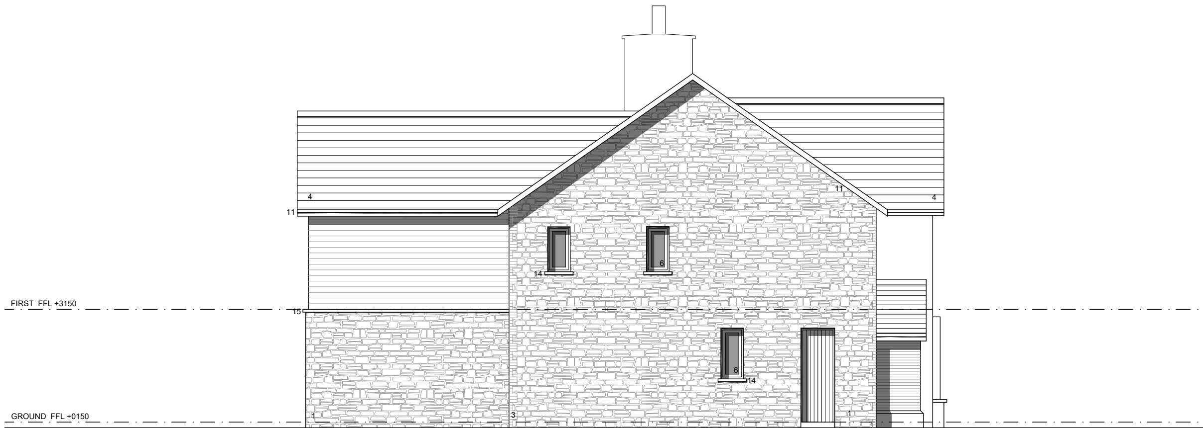
SIDE ELEVATION (NORTH FACING)