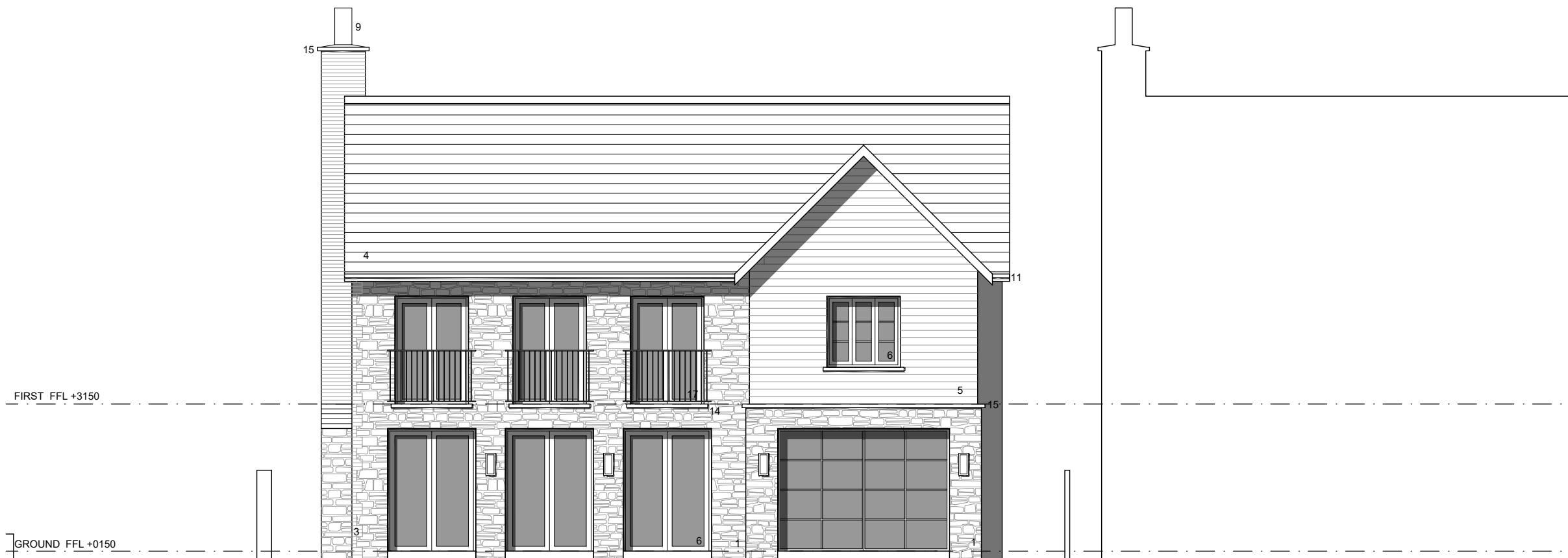
REAR ELEVATION (EAST FACING)