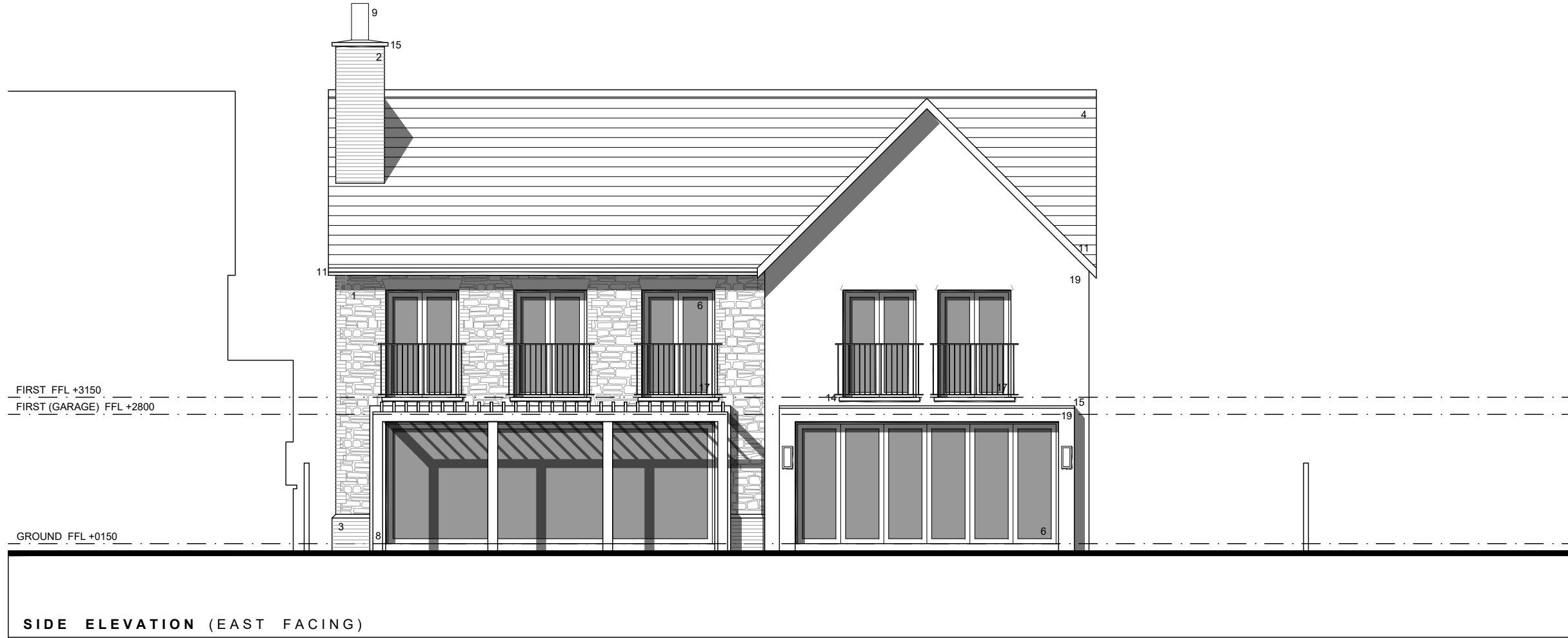
SIDE ELEVATION (EAST FACING)