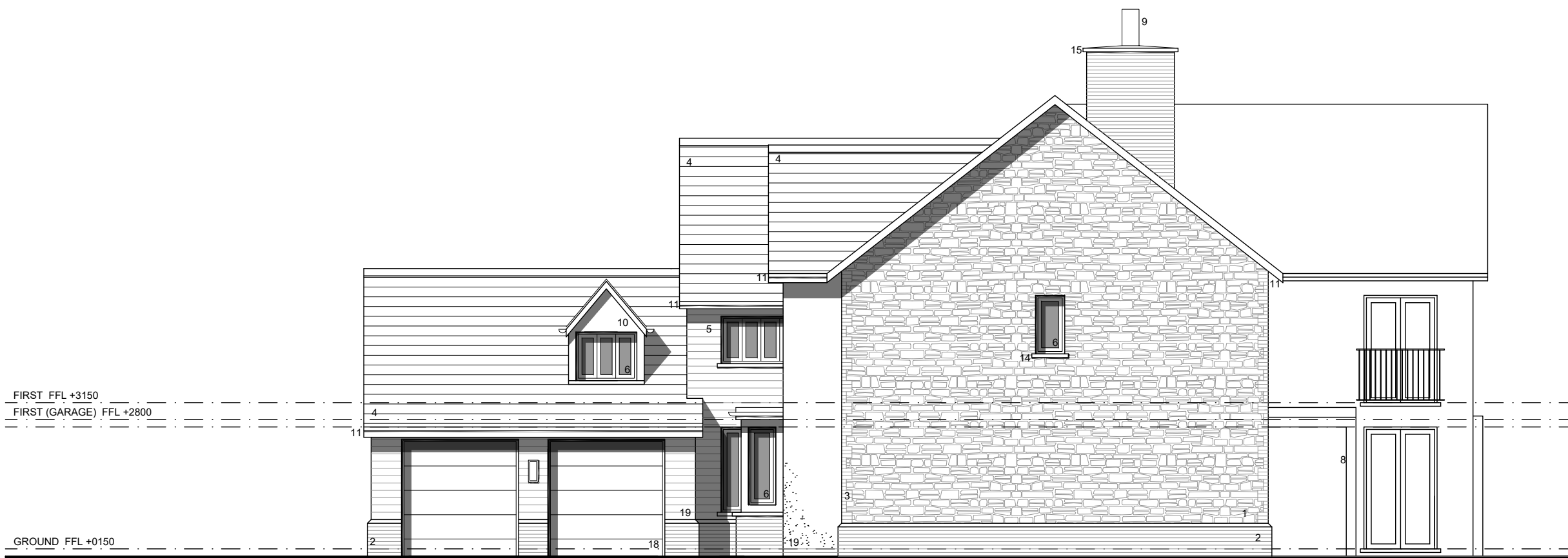
FRONT ELEVATION (SOUTH FACING)