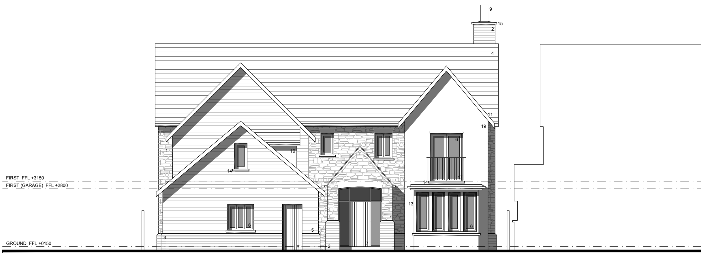
SIDE ELEVATION (WEST FACING)