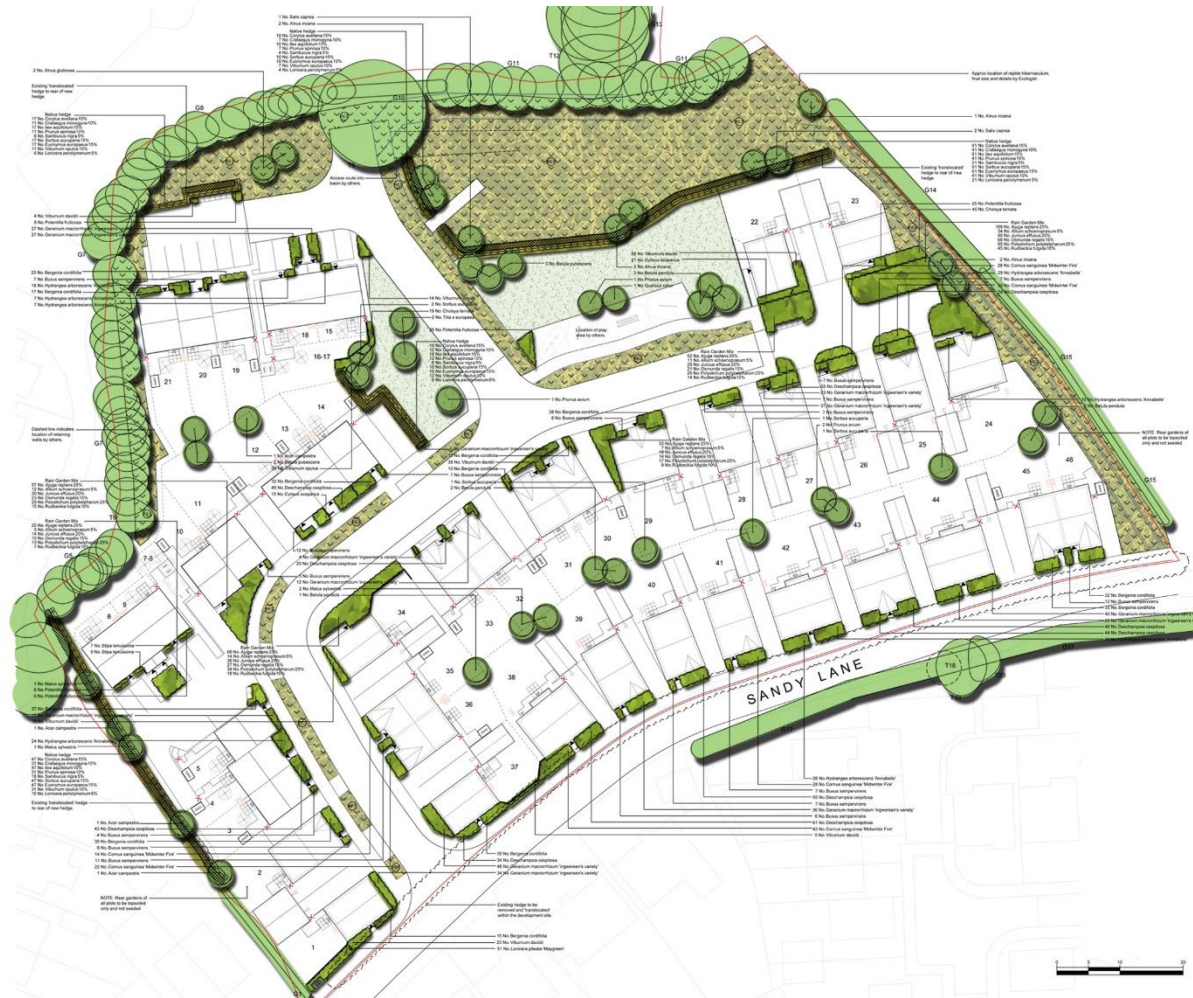
Figure 02 - Extract from DPLA drawing 1179.01

An extract of the soft landscape proposals drawing is copied below and clearly describes the design intent for the planting areas.