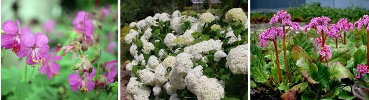
Rain Garden planting.

This gives us an excellent opportunity at surface level to create rich wetland and grassland habitats capable of holding water on site. This will improve and manage water quality, enhance biodiversity as well as providing amenity for the people using the site.