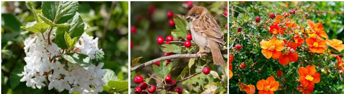
Landscape features to benefit people and wildlife.

The combination of the above measures will enhance biodiversity across the site and demonstrates every effort is being made to create a multi-functional landscape.