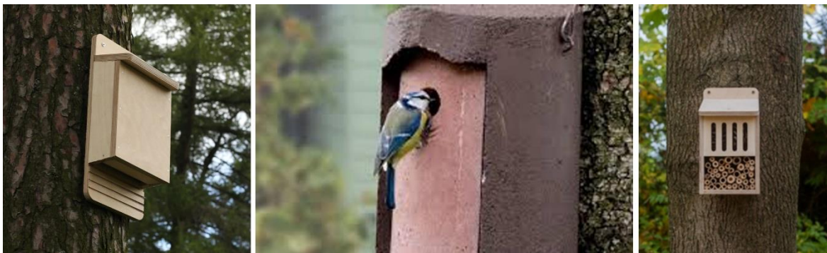
Bat / bird boxes and invertebrate refugia.

In addition to the habitats created through the planting design, the site will also include other ecological measures. Bat and bird boxes and invertebrate refugia will be provided and will be installed on the new buildings. The exact number and locations to be determined by others.