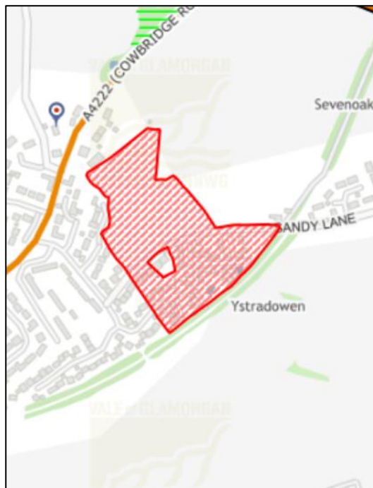
Figure 2: Extracts of Vale of Glamorgan County Proposals Map