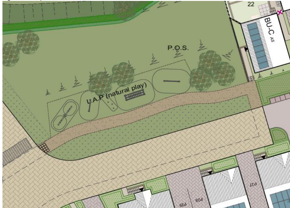
Figure.6: Proposed LAP