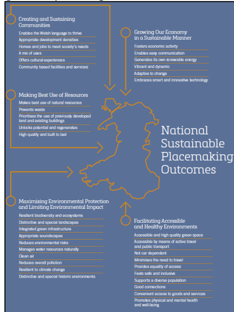
Figure 5: Key Planning Policies and the National Sustainable Placemaking Outcomes (extract from PPW 12)

PPW defines placemaking as a “holistic approach to the planning and design of development and spaces, focused on positive outcomes”. This approach “considers the context, function and relationships between a development site and its wider surroundings” and “adds social, economic, environmental and cultural value to development proposals resulting in benefits which go beyond a physical development boundary”.