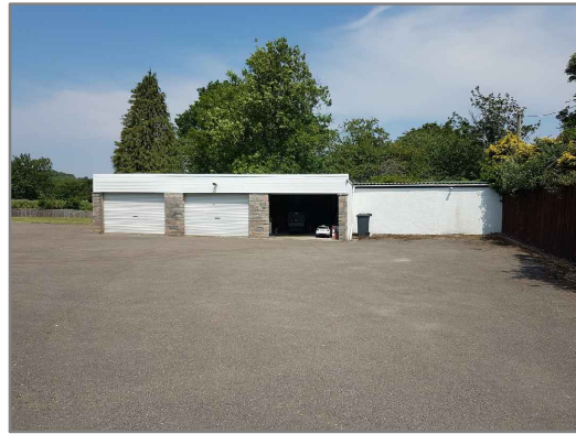
VIEW OF EXISTING GARAGE