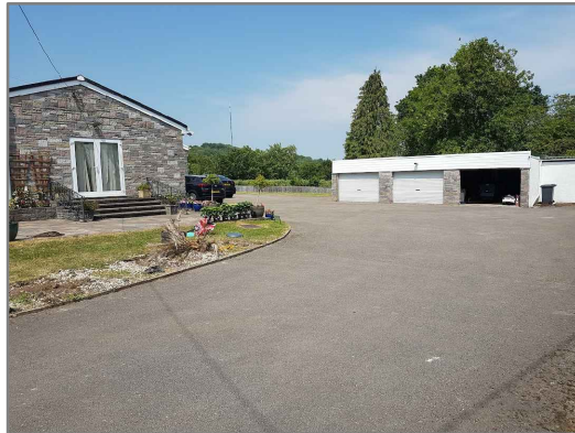
VIEW OF EXISTING DWELLING AND GARAGE