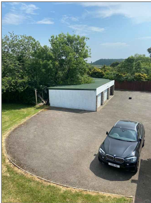
VIEW OF EXISTING GARAGE