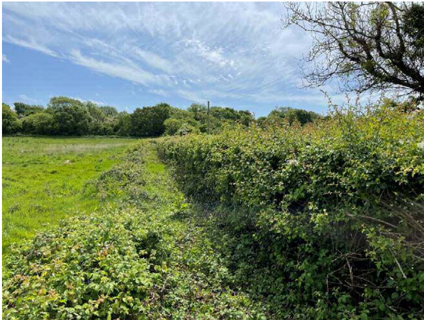
Plate 2 West section of Fort Road, looking east