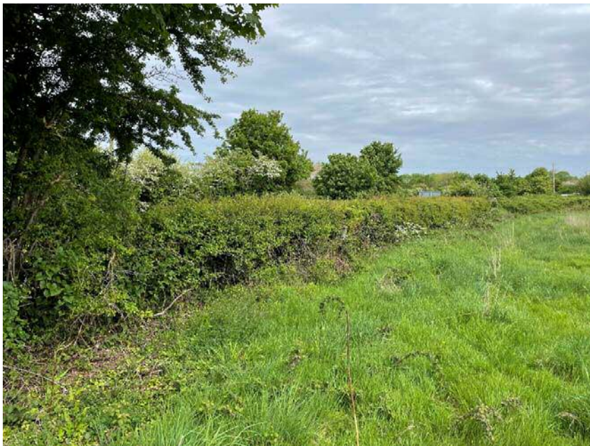
Plate 1 Lavernock Road Hedge looking north

3.3 Ground cover & climbers noted included Bramble, Nettle, Hedge Bindweed, Cow Parsley, Black Bryony, Traveller's Joy, Ivy, none of which are listed as Woodland Species in the Hedgerow Regulations. The Lavernock Road Hedge does not meet criteria as Important.