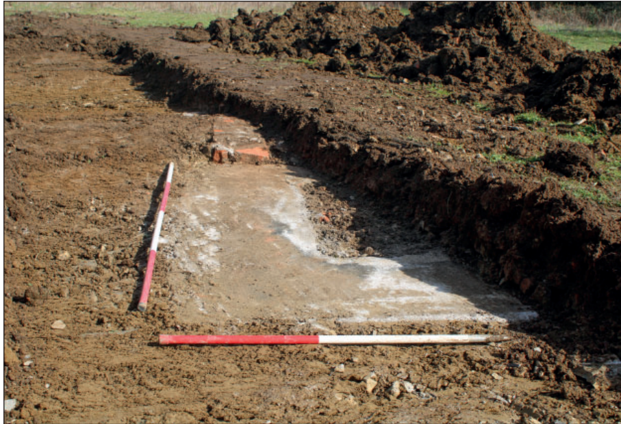
Figure 8: Trench 9 structure 903 in plan, looking east, scales 2 m and 1 m