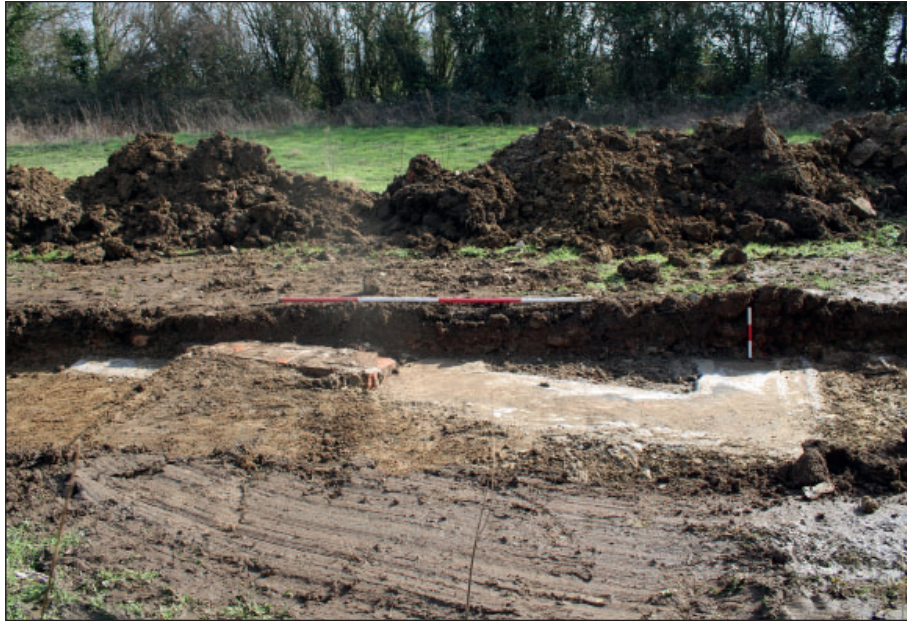
Figure 9: Trench 9 structure 903 in section, looking southeast, scales 2 m and 0.3 m