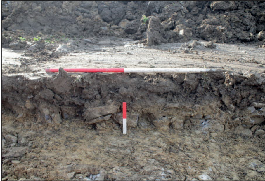
Figure 7: Trench 5 section view, looking south, scales 1 m and 0.2 m