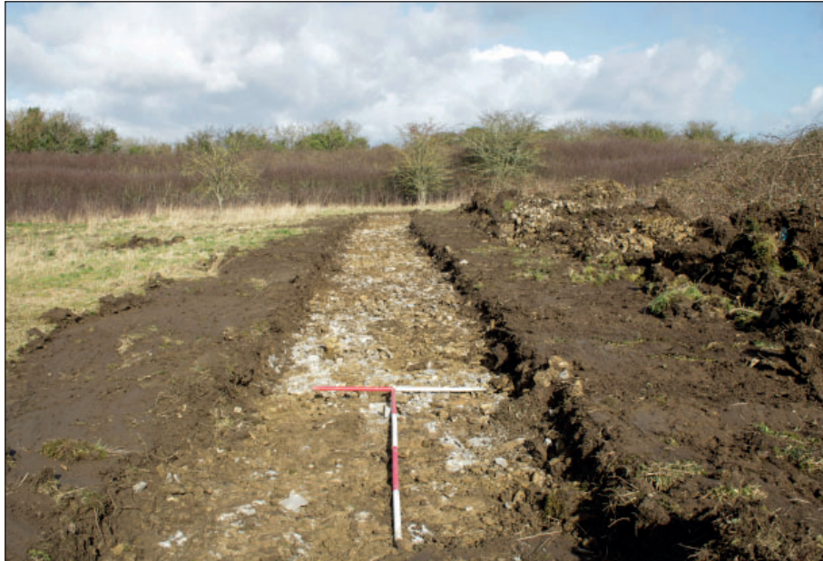
Figure 10: Trench 10 plan view, looking northeast, scales 2 m and 1 m