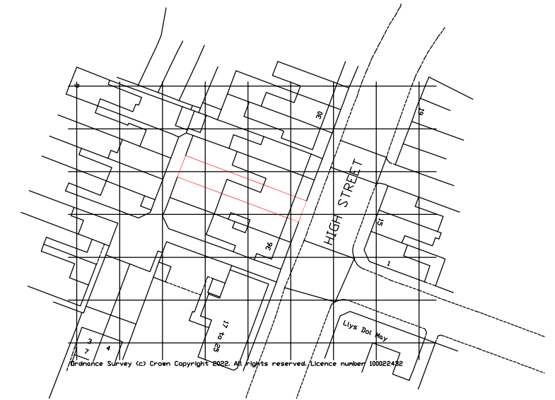
SITE LOCATION PLAN scale 1 : 1250