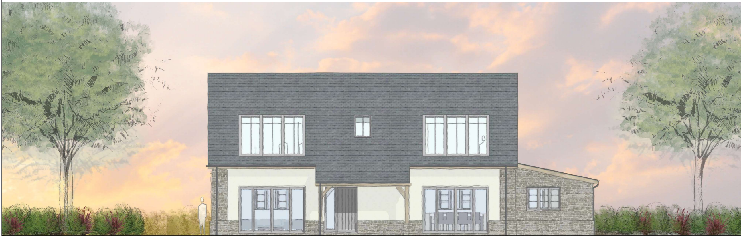
WEST ELEVATION Proposed Scale 1:100