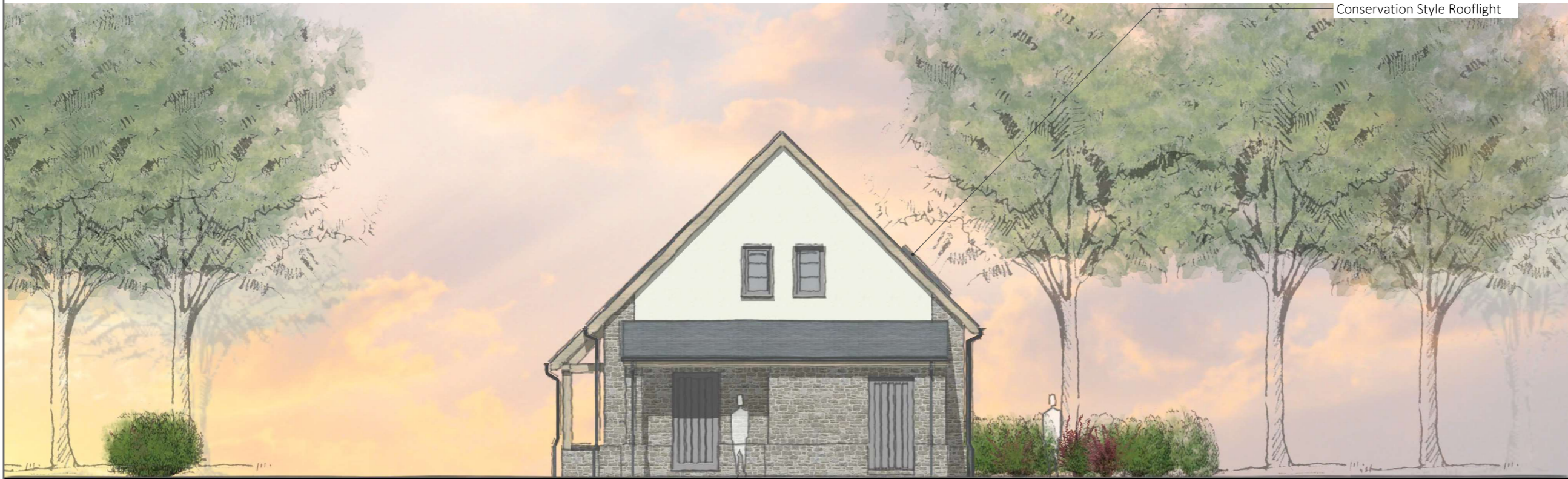
SOUTH ELEVATION Proposed Scale 1:100