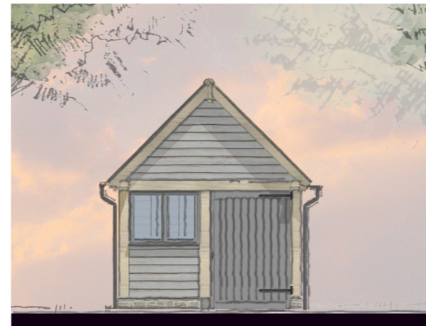
GARAGE NORTH ELEVATION