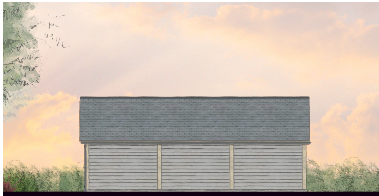
GARAGE WEST ELEVATION