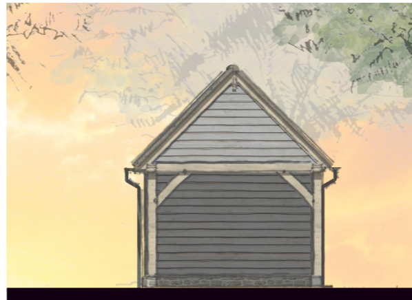
GARAGE SOUTH ELEVATION