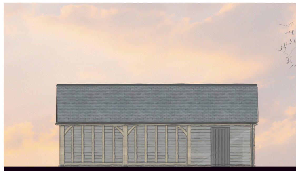
GARAGE EAST ELEVATION