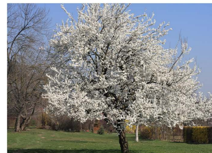
Feature tree - Prunus Avium