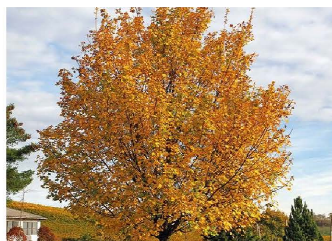
Feature tree - Acer Campestre