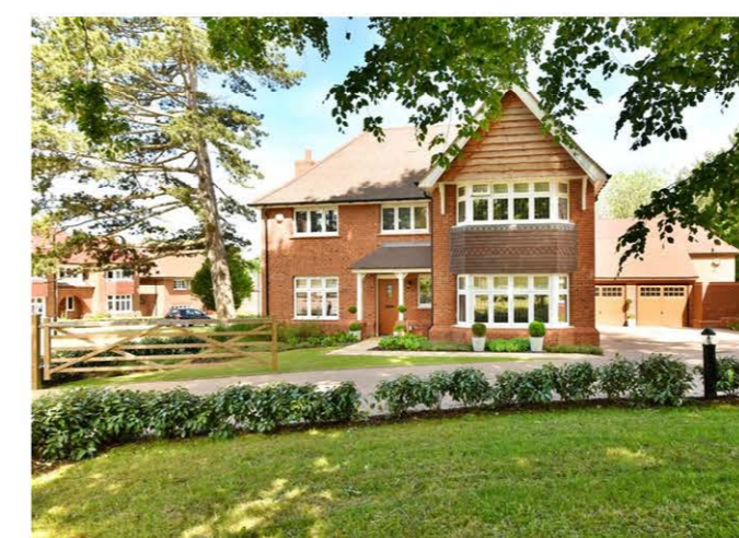
Houses in a woodland setting