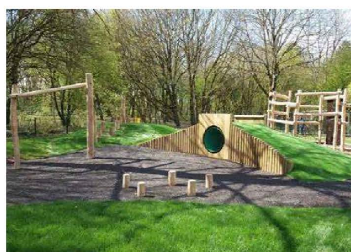
Natural play components