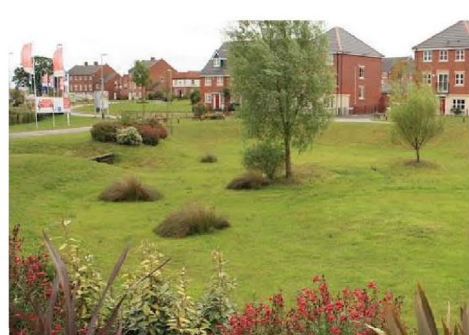
Dry attenuation basin