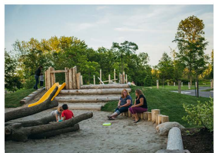
Natural play area