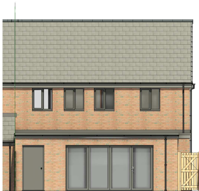
03 PROPOSED REAR ELEVATION 1 : 100