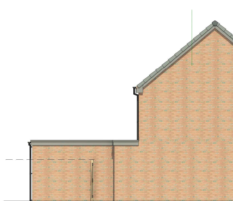
04 PROPOSED SIDE ELEVATION 1 : 100