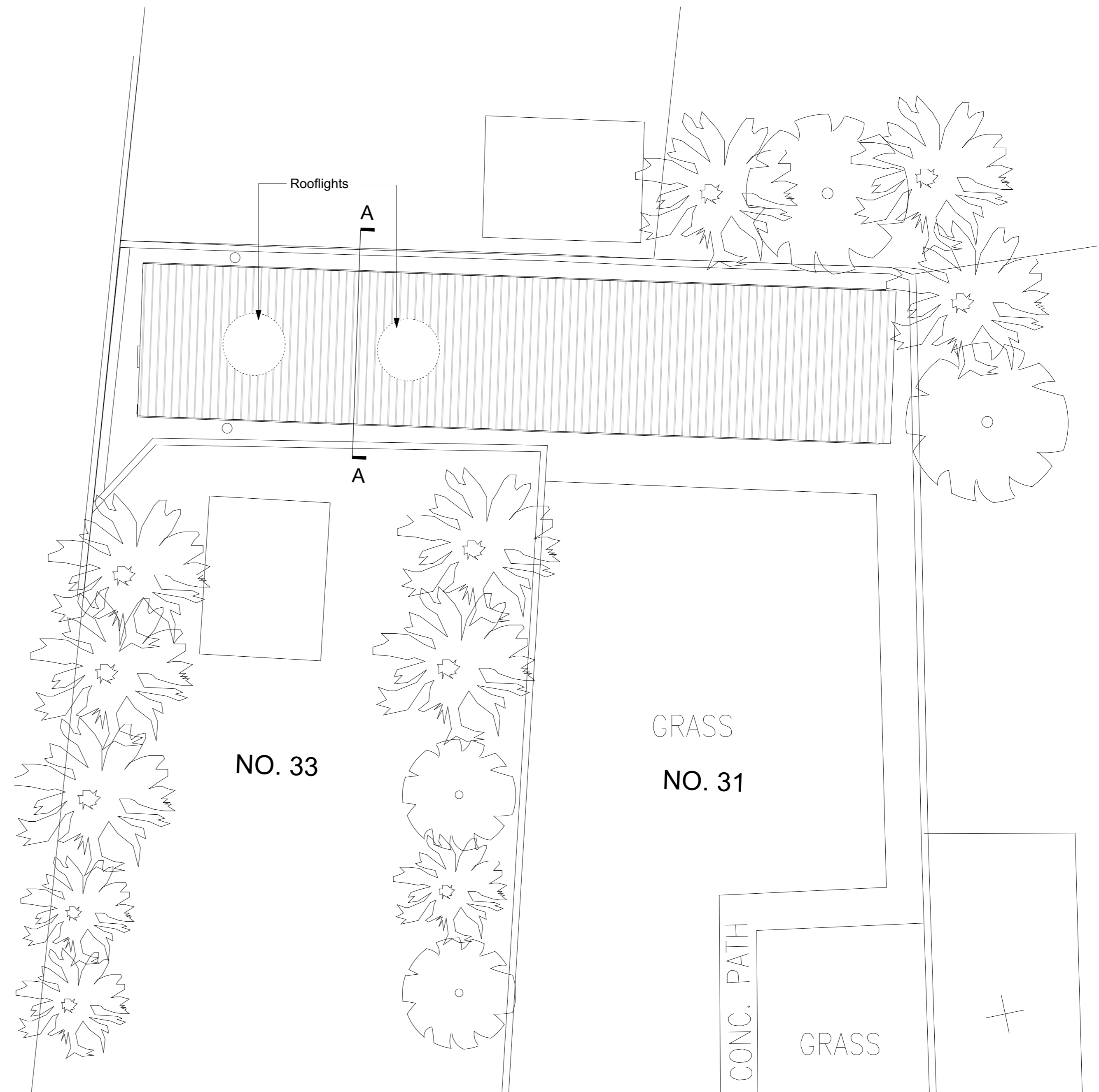
ROOF PLAN 1:50