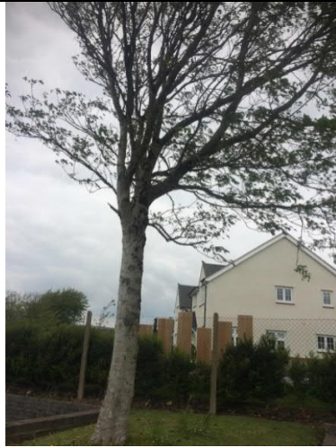
Photograph 14: Tree 1.