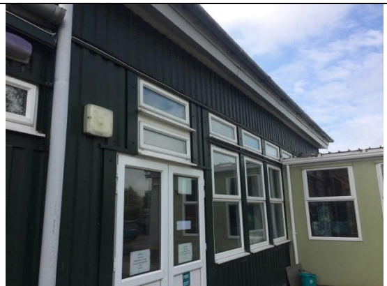
Photograph 22: Building 1