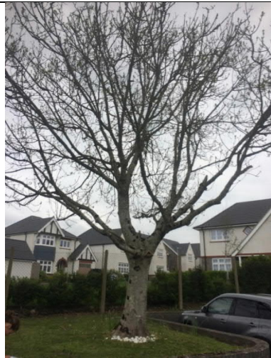
Photograph 15: Tree 2.