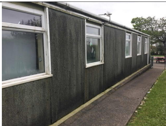
Photograph 18: Building 2.