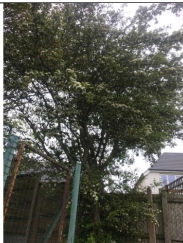
Photograph 17: Tree 5.