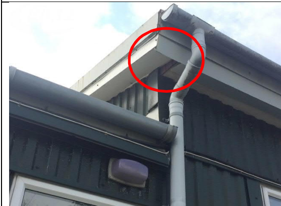
Photograph 23: Building 1, gap under fascia boards.