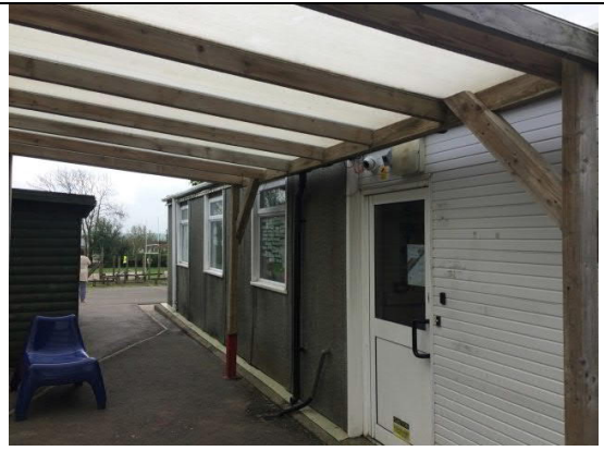
Photograph 20: Building 3