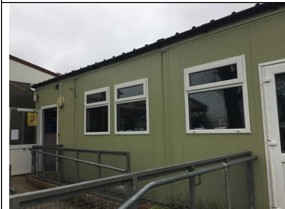
Photograph 21: Building 3