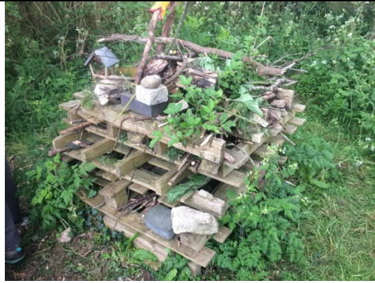
Photograph 13: Bug hotel in 'Forest Schools nature area'.