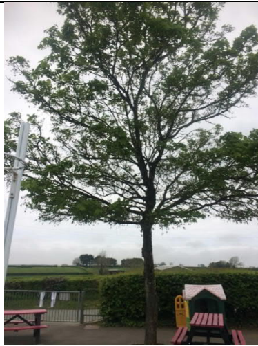
Photograph 16: Tree 3.