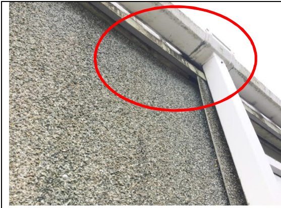
Photograph 19: Building 2. Gaps under fascia boards.