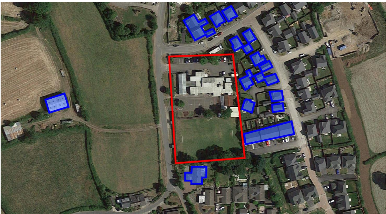
Figure 2.1: Proposed Development (Red), Existing School Boundary (red), and Nearest Noise Sensitive Receivers (Blue)

The proposed extension is to be located on the existing site of St David's Primary School. Residential dwellings surround the site with some agricultural land to the west. The site in relation to its surroundings is presented below.