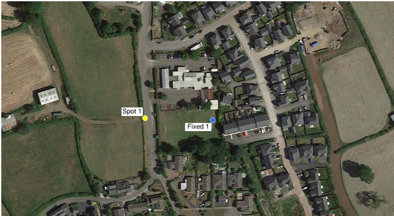
Figure 2.2: Measurement Positions

Measurement positions used throughout the survey are shown below, with long-term measurement position in blue, and short-term measurement position yellow.