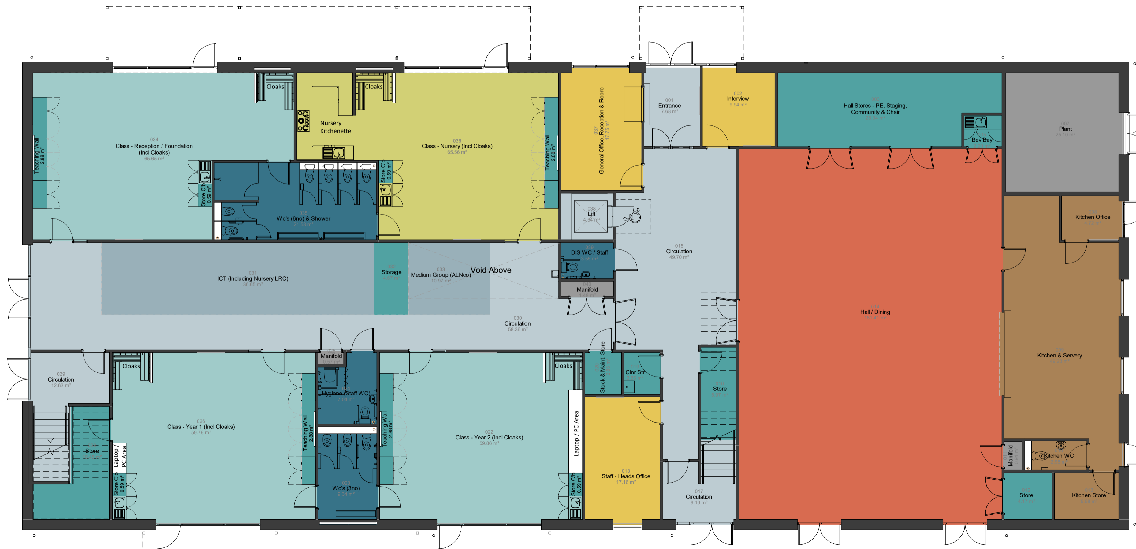
01_First Floor Plan 1:100