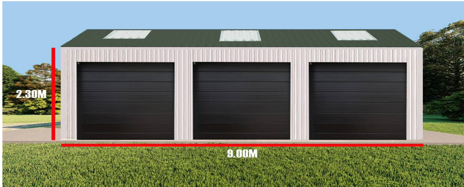
Visual representation of proposed garage – juniper green roof, white walls and black sectional doors