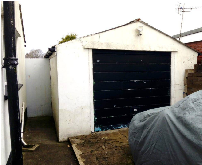
Garage – white walls with grey roof, black garage door