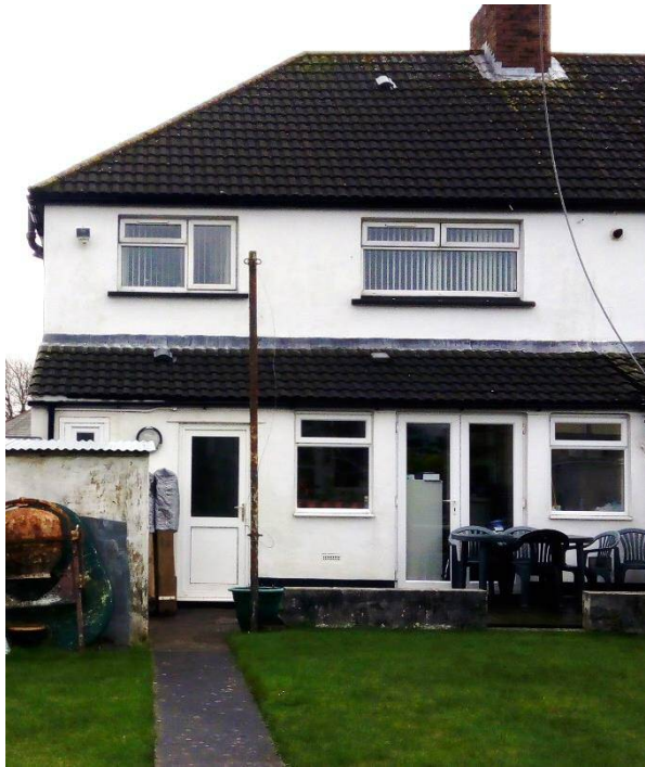
House – white walls with green roof