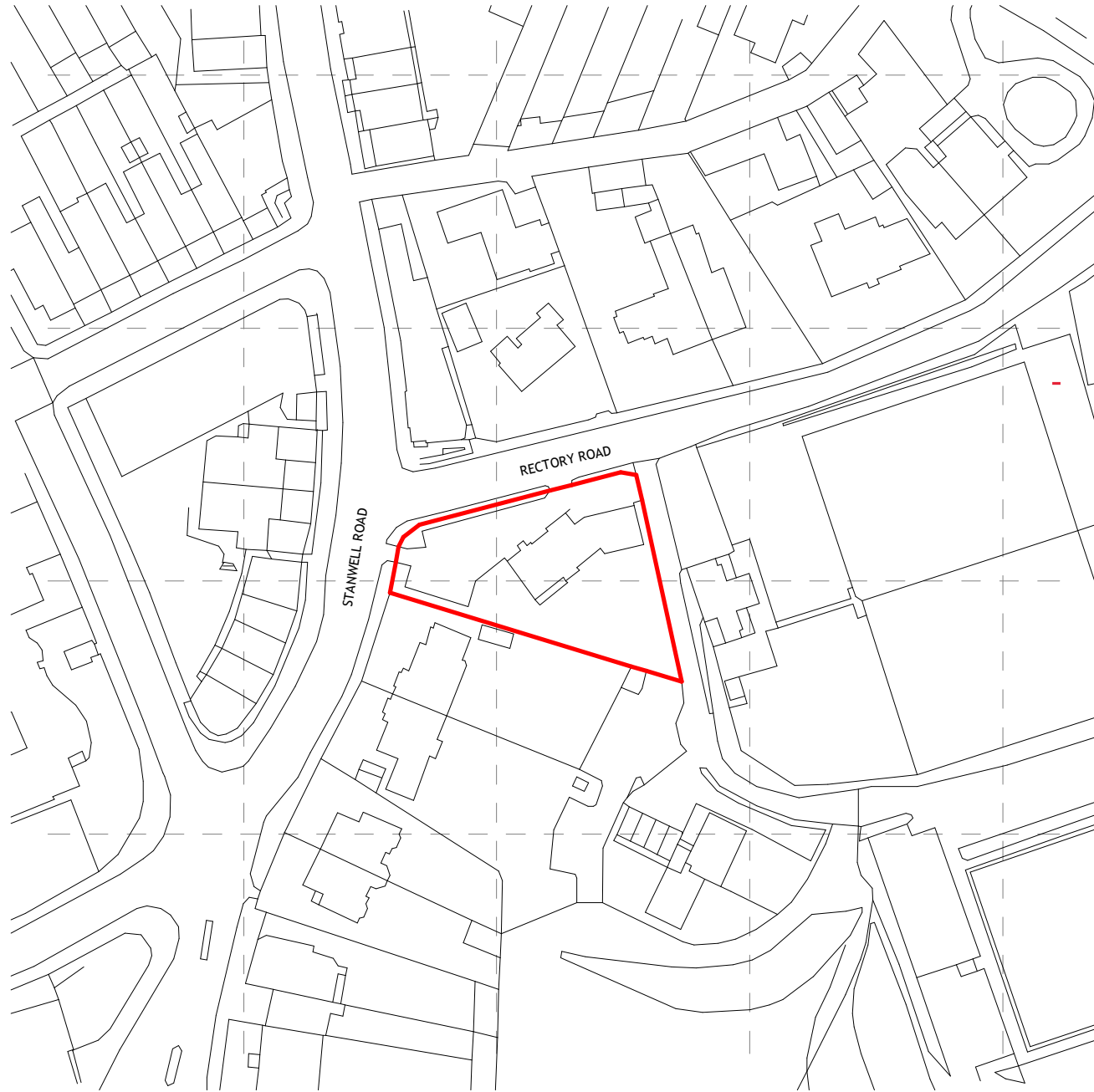
01 SITE LOCATION PLAN 1 : 1250