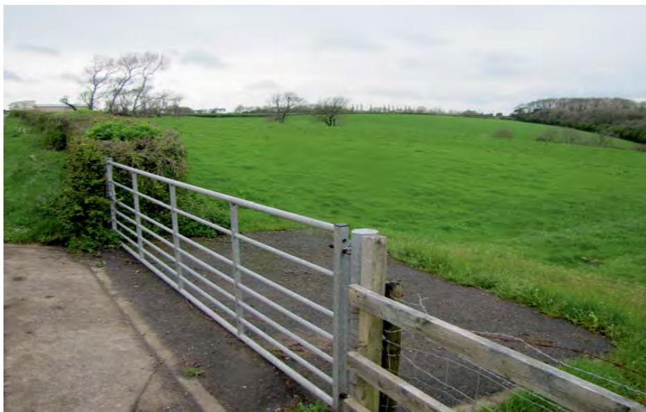
Plate 3: Looking north-east towards Model Farm from the south-western corner of the study site. This photo shows the gently undulating topography of the study site.