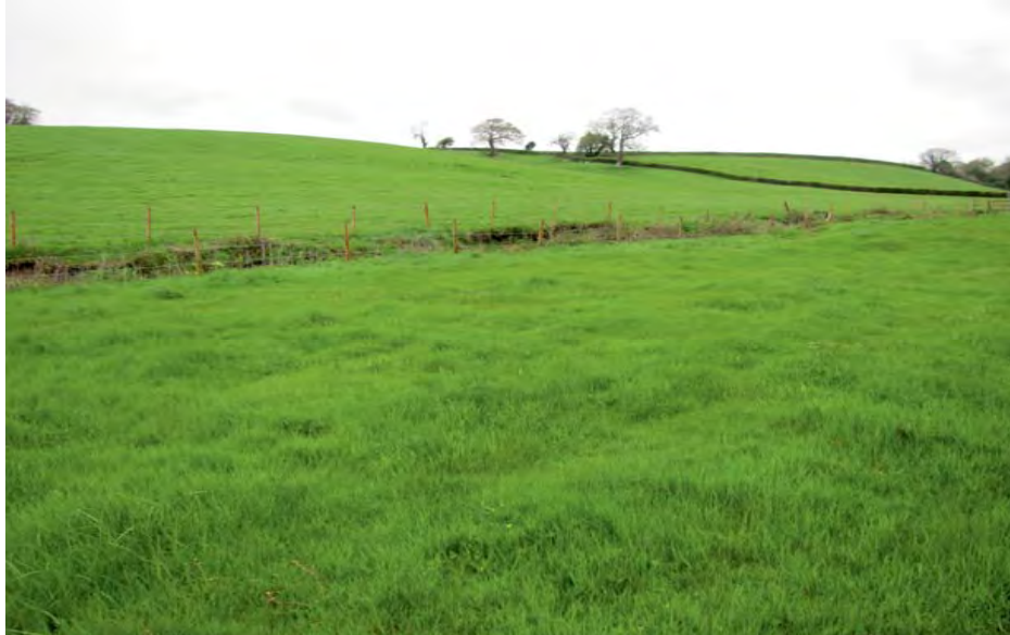
Plate 5: Looking north across the study site from close to the confluence of the Bullhouse and Whitelands Brooks