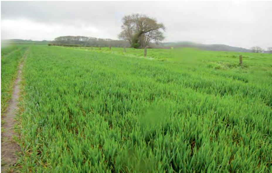
Plate 1: Looking north-west across the study site from the western boundary.