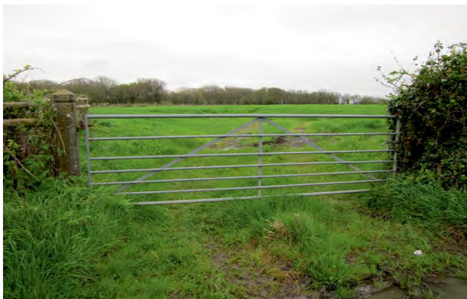
Plate 7: Looking south towards The Bulwarks scheduled monument, from 250m north of the railway line, illustrating how the tree belt along the railway line encloses any views to (or from) the hillfort.