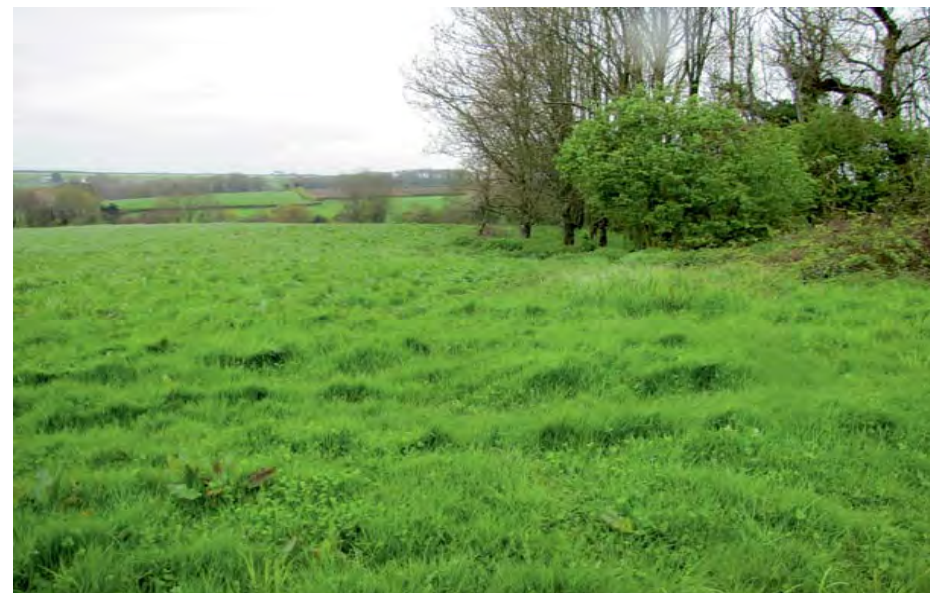
Plate 4: Looking south-west across the study site from the east side of the Whitelands Brook.