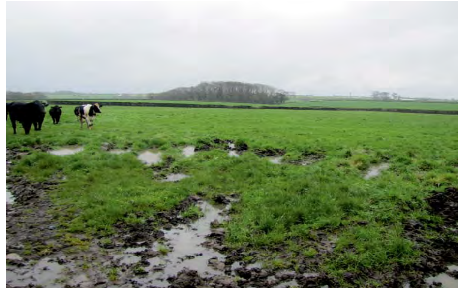
Plate 6: Looking south across the study site from the centre of the northern boundary (directly towards The Bulwarks Scheduled Monument). The long line of trees marks the railway line, which forms a strong boundary to views in this direction.