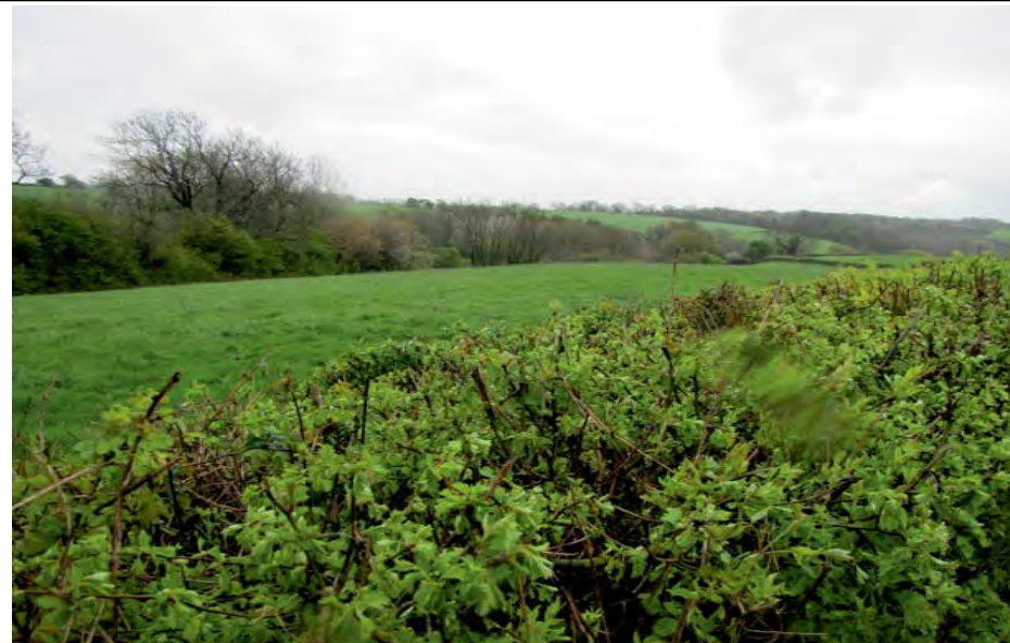
Plate 2: Looking south-west across the study site from the eastern boundary.