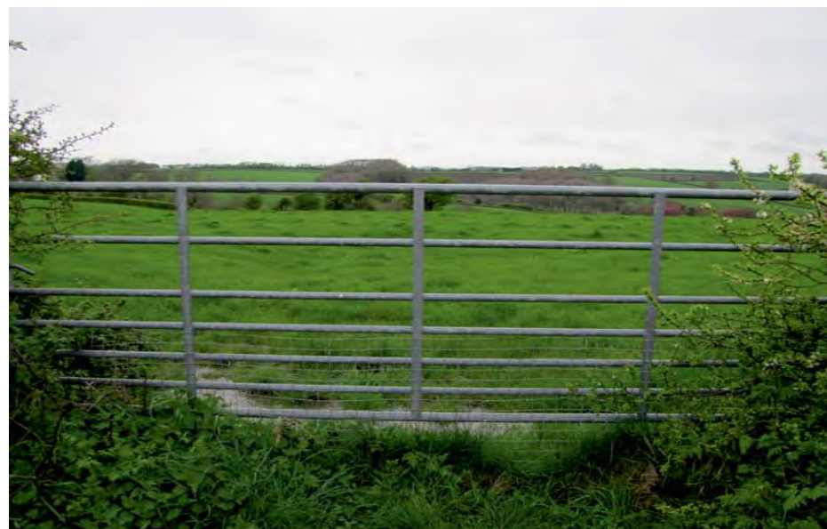
Plate 8: Looking north across the study site from the same position as Plate 6, 450m beyond the southern boundary of the study site.