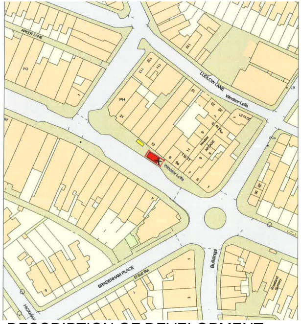
DESCRIPTION OF DEVELOPMENT

The application relates to a bus shelter on Windsor Road opposite 11, Windsor Road (Funky Monkey), within the Penarth settlement boundary and conservation area, as identified by the adopted Vale of Glamorgan Local Development Plan (LDP) 2011-2026. The location of the shelter is shown on the map below.